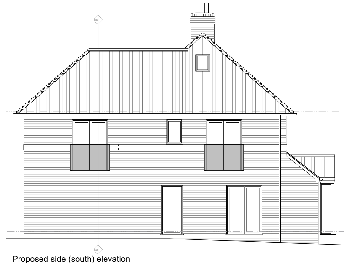
Proposed side (south) elevation