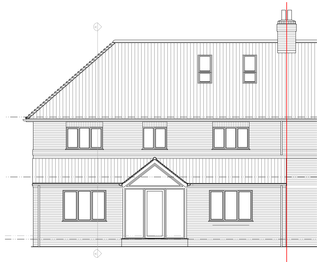
Proposed front (east) elevation