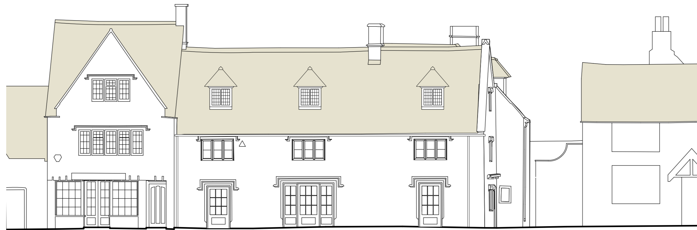
South-West High Street Elevation