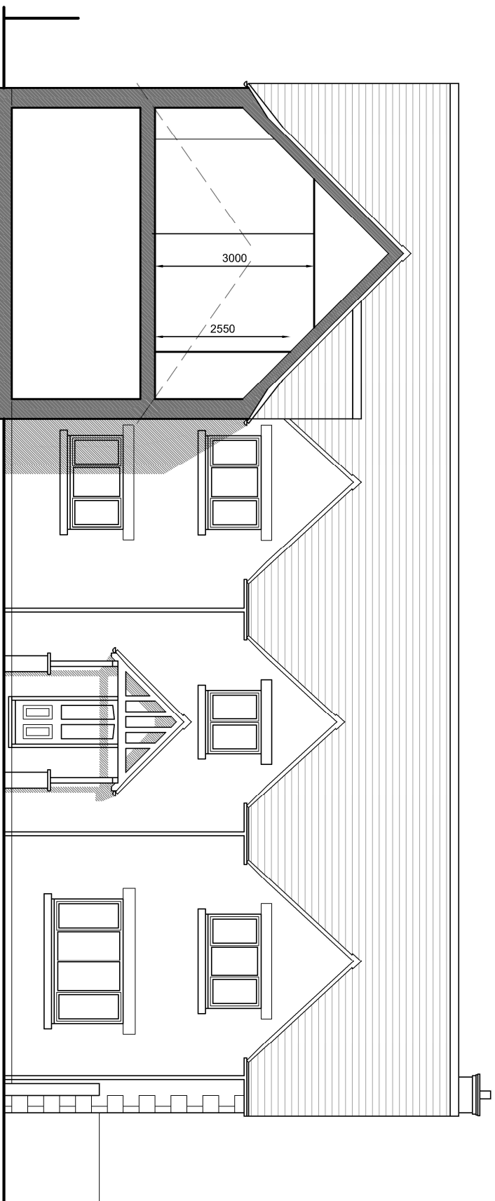
INTERNAL NORTH ELEVATION