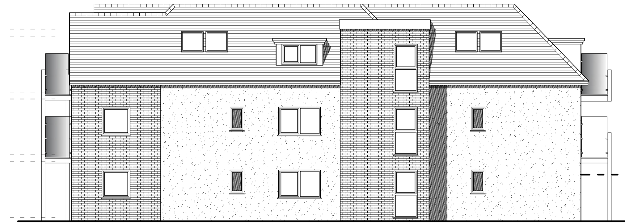
Side Elevation (E)