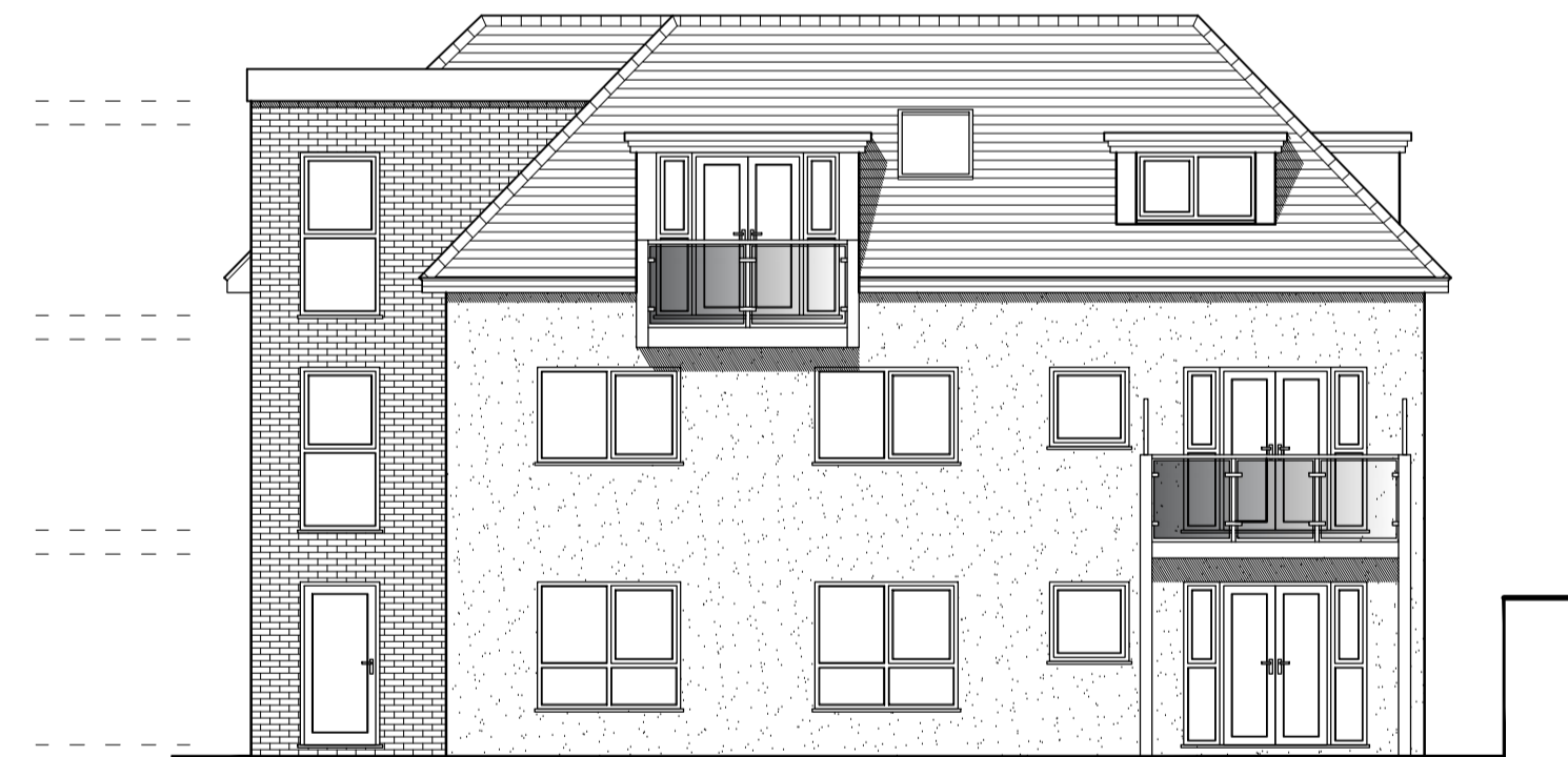
Rear Elevation (N)