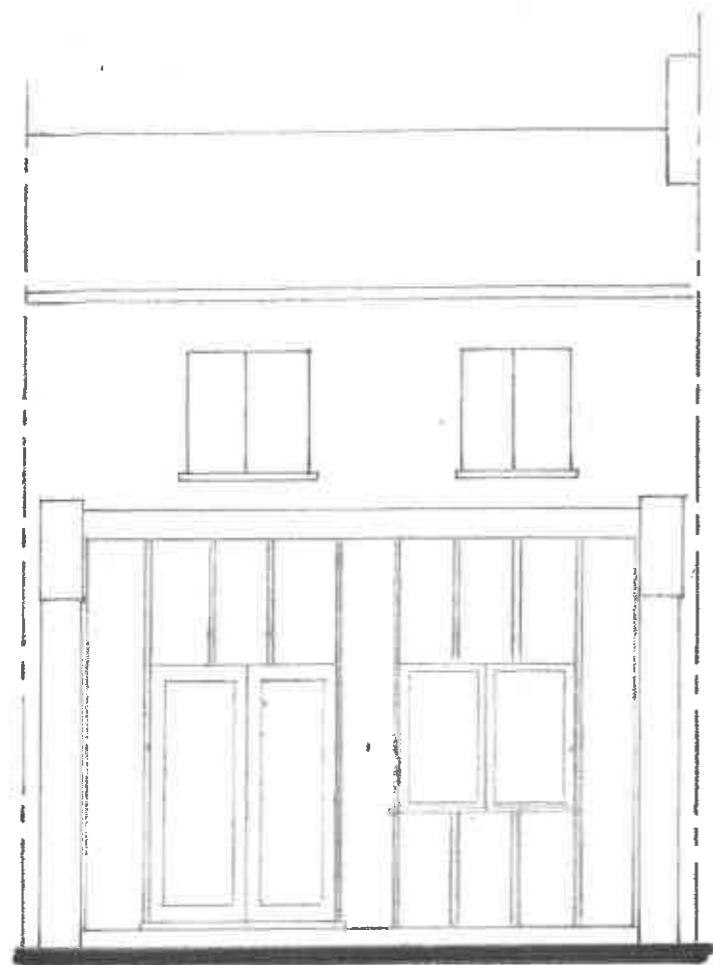
SOUTH ELEVATION. (Scale - 1:50 @ A.3)