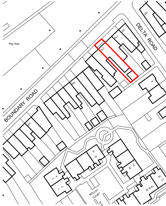
(c) Crown Copyright and Database Rights 2022 OS 10060020