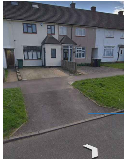
NO.15 DROPPED KERB AND CROSS OVER