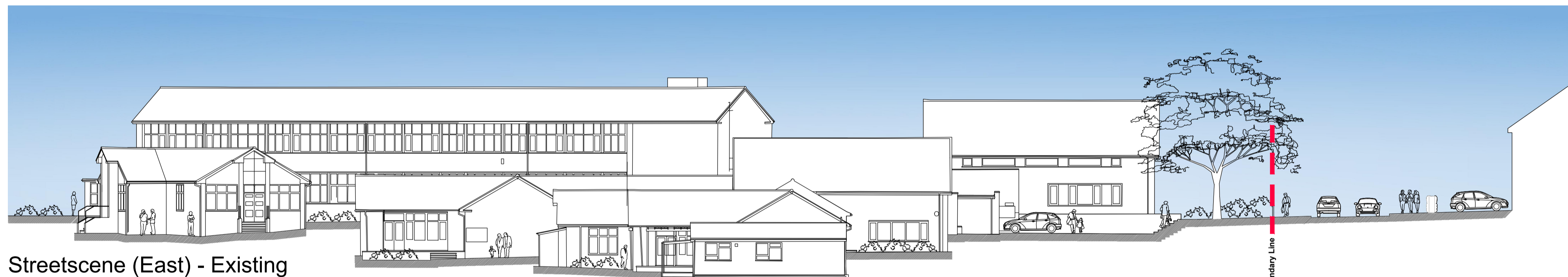
Streetscene (East) - Existing