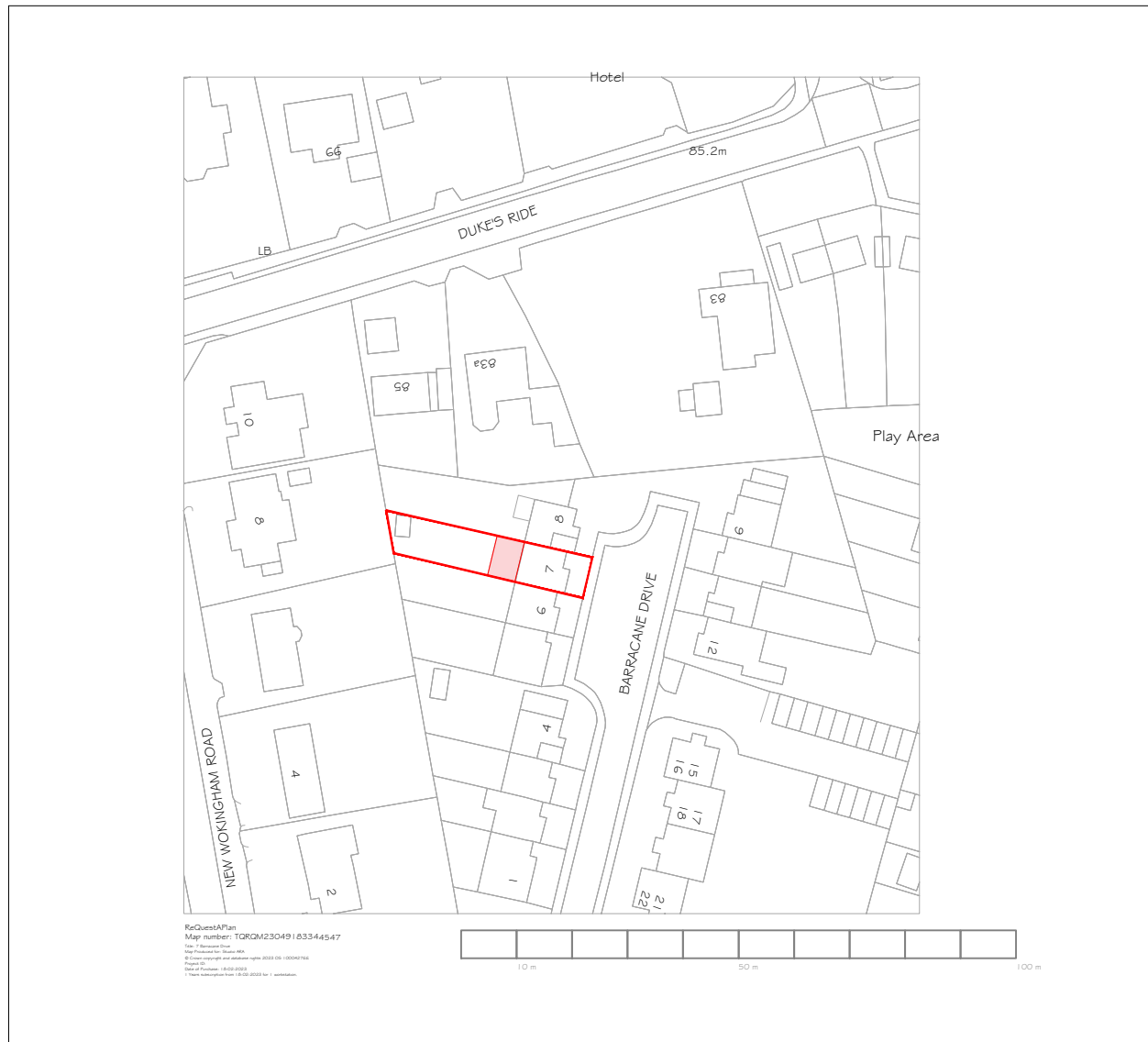
01 LOCATION PLAN Scale 1:1250