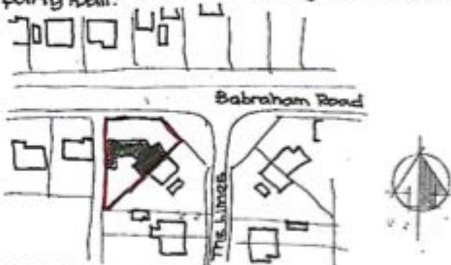
LOCATION PLAN. 1:1250

party wall act - the client attention is drawn to the requirements of the Party Wall Act 1996 and that the neighbours written approval is required before any work is carried out to or near a party wall.