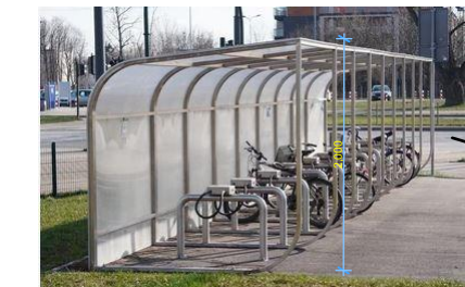
Proposed 2.0m High Cycle Enclosure