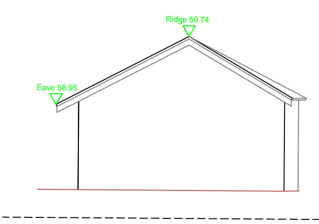
------FLANK ELEVATION DATUM LEVEL = 56.00m