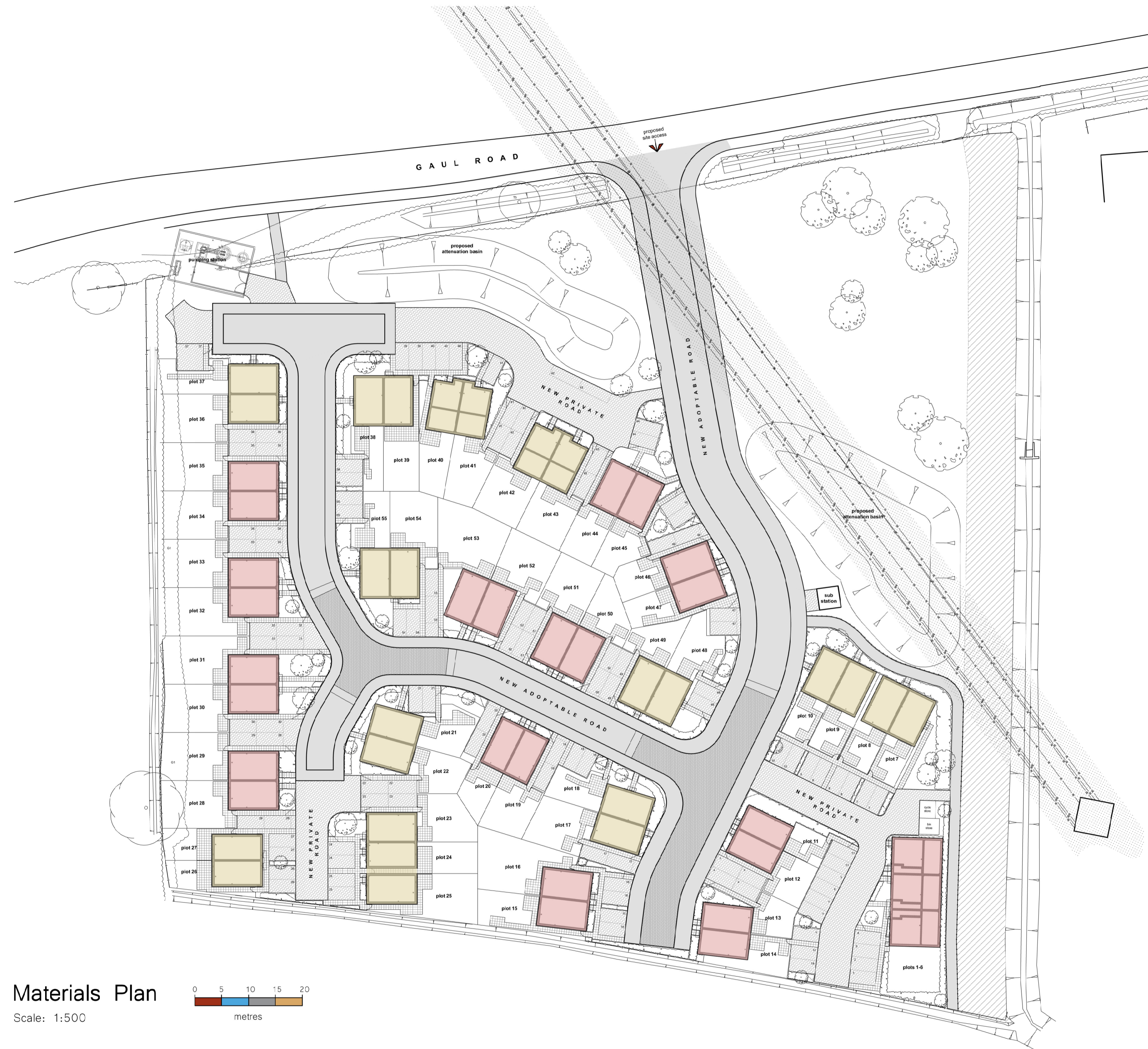
Materials Plan Scale: 1:500

General Notes 1. Figured dimensions only to be used. 2. The contractor, sub-contractors and suppliers must verify all dimensions on site prior to the commencement of any work. 3. This drawing is to be read in conjunction with all relevant engineers and specialist sub-contractors drawings and specifications. 4. Any discrepancies are to be brought to the designers attention.