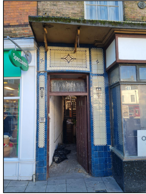
SIDE PASSAGE OPENING