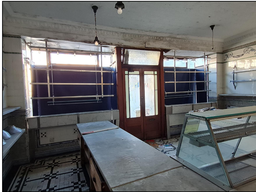
INTERIOR VIEW OF SHOP LOOKING ONTO SHOP FRONT