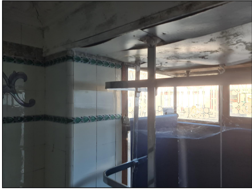
VIEW OF EXISTING BEAM BEARING