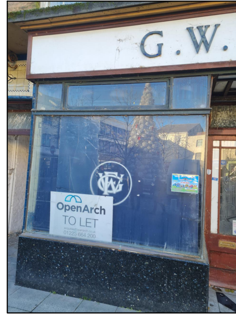
SHOP FRONT PROJECTION