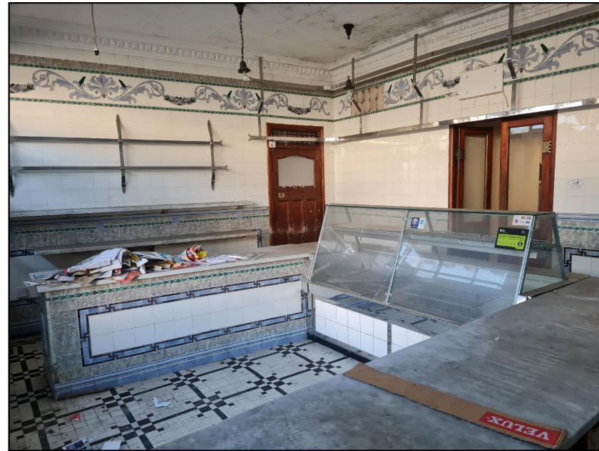
INTERIOR VIEW OF SHOP LOOKING ONTO REAR DIVISION WALL

NOTE: DRAWINGS TO BE READ IN CONJUNCTION WITH 'APPENDIX A' LISTING