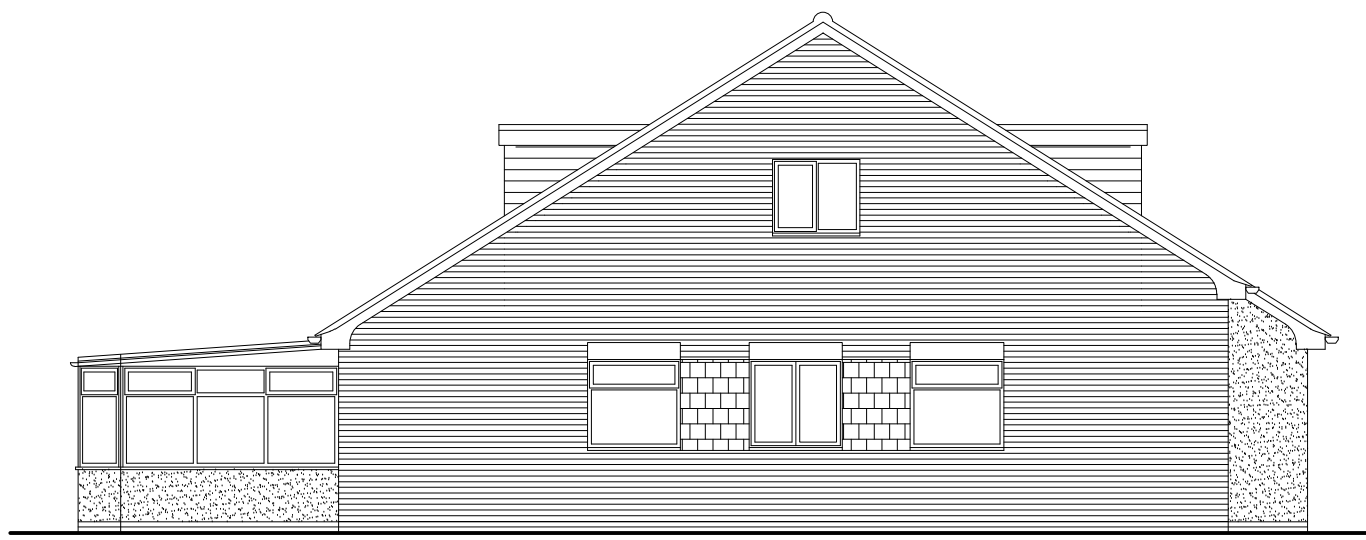
West Elevation - Side