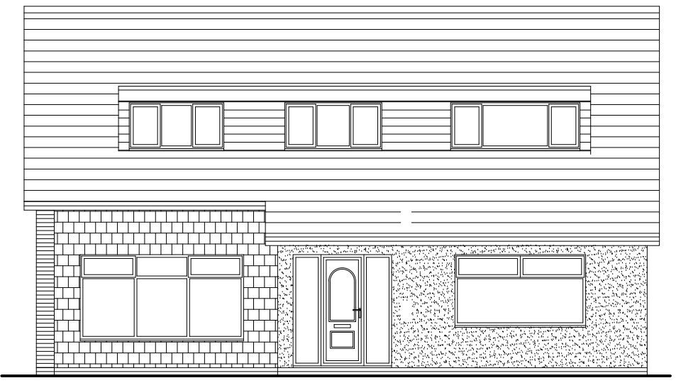
South Elevation - Front