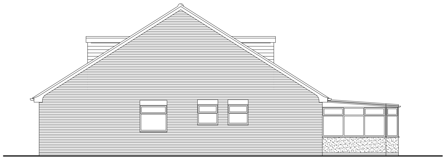
East Elevation - Side

Materials Roof :- Concrete tile to pitched roof. Felt flat roof. Walls :- Face brick, Render, Stone panel. Fascia and Soffit :- White plastic. Windows :- PVCu White and brown double glazed, Door :- PVCu double glazed. Gutter :- plastic. Conservatory Roof :- Polycarbonate flat roof