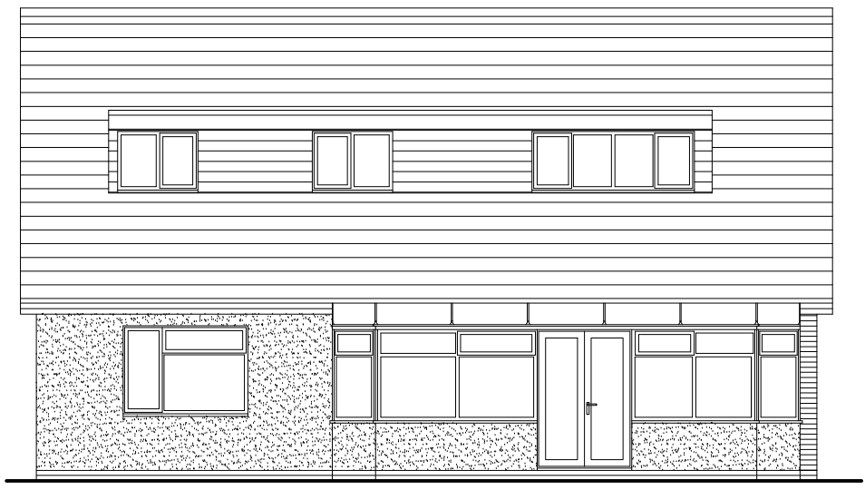
North Elevation - Rear