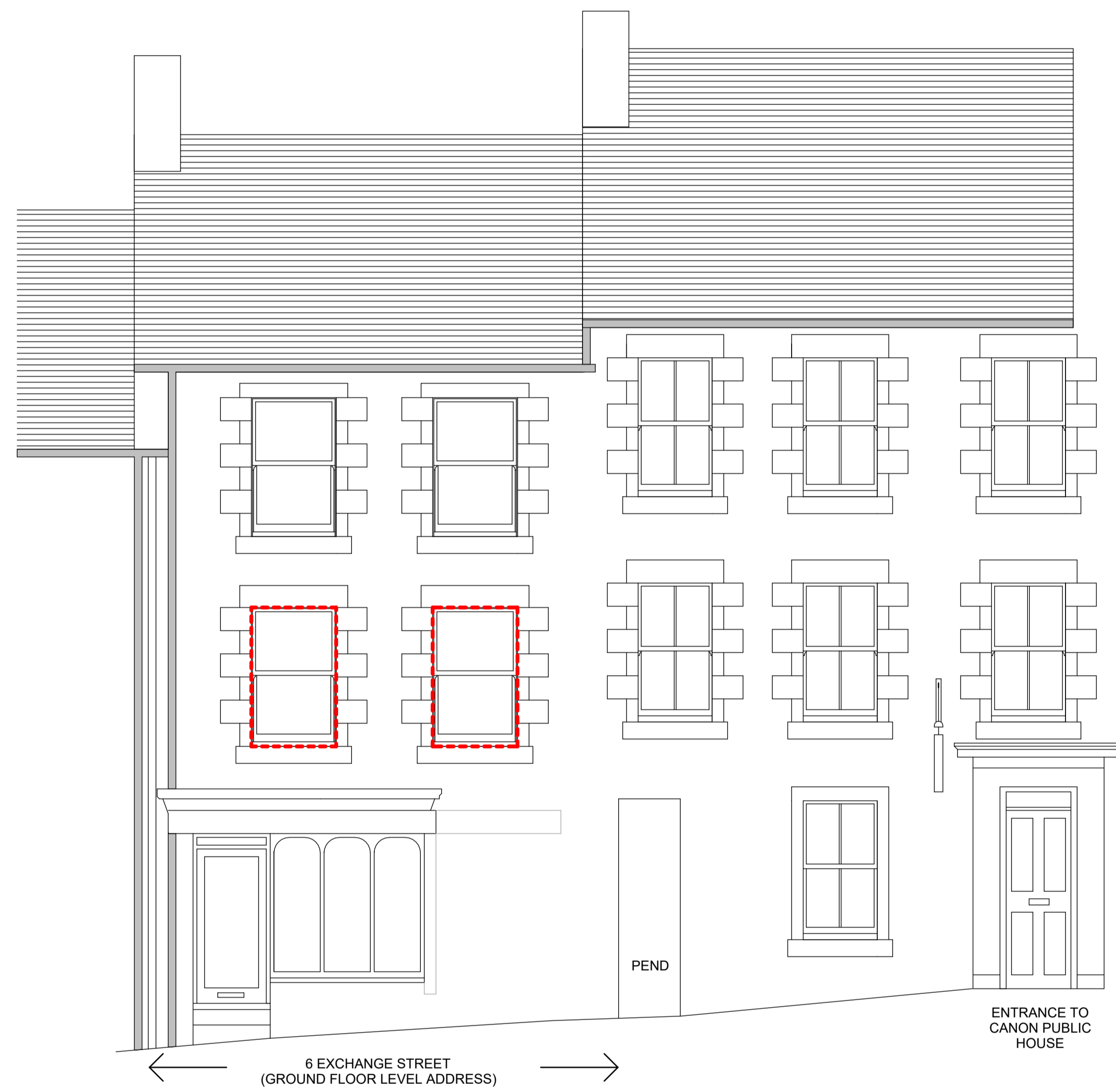
1 North Elevation (Exchange Street) 1 : 50

RED DASHED LINES DENOTE WINDOWS TO BE REPLACED