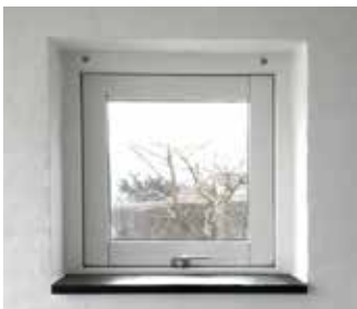
➤ Conventional window