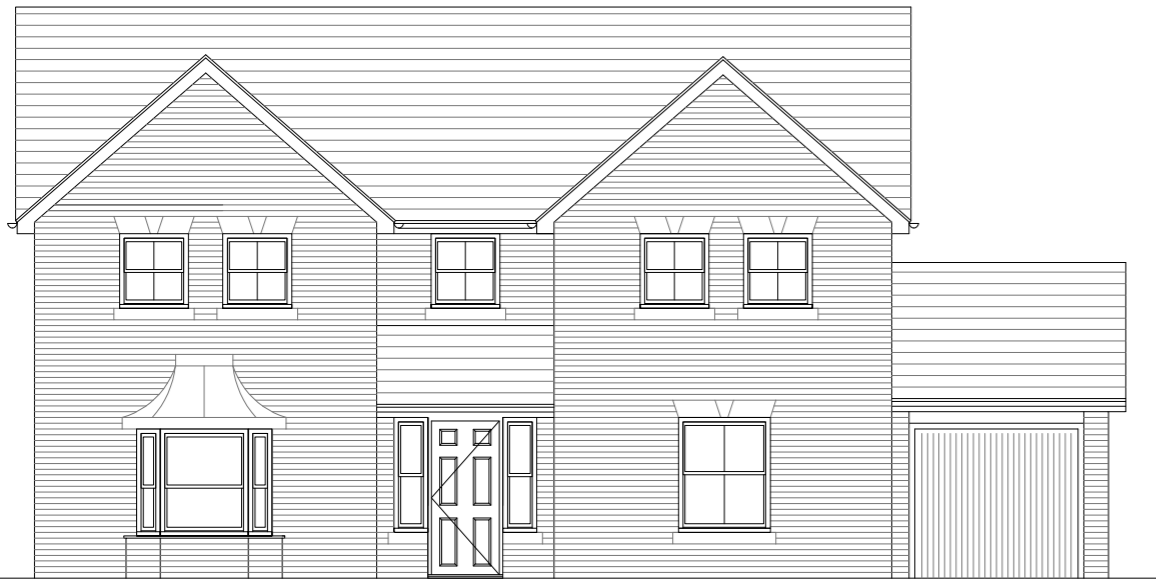
Front Elevation (Street View)