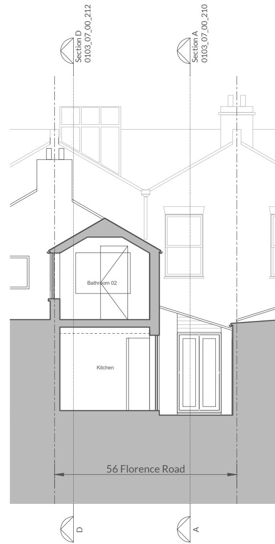
2) EXISTING - SECTION C