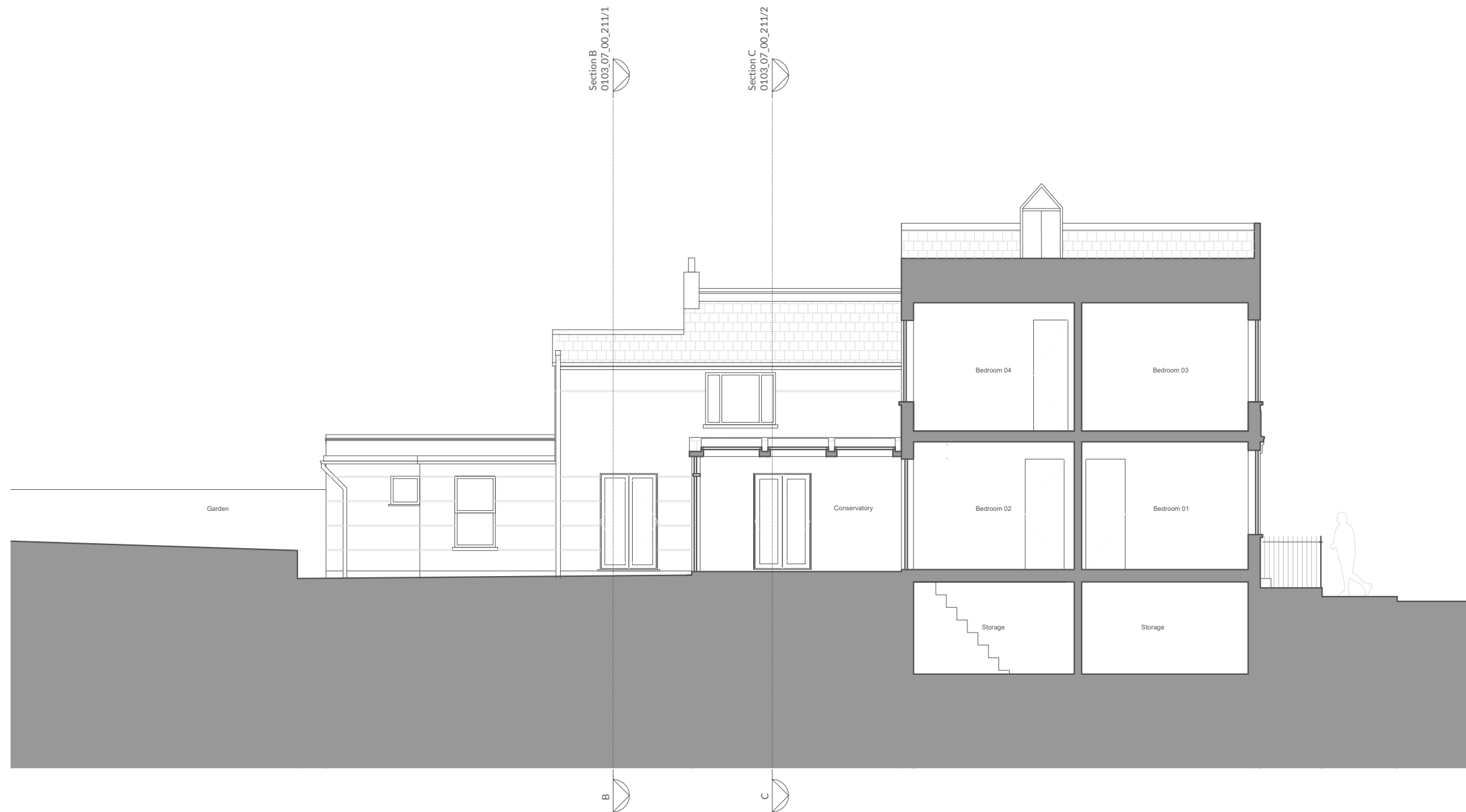
1) EXISTING - SECTION A / SIDE ELEVATION