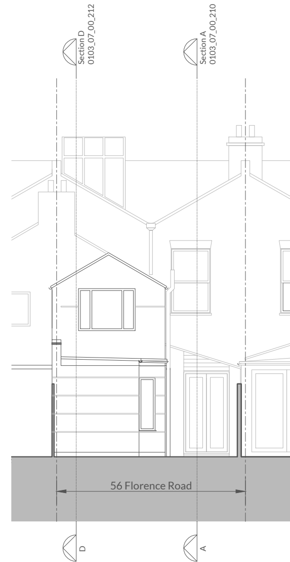
2) EXISTING - ELEVATION - NORTH / REAR