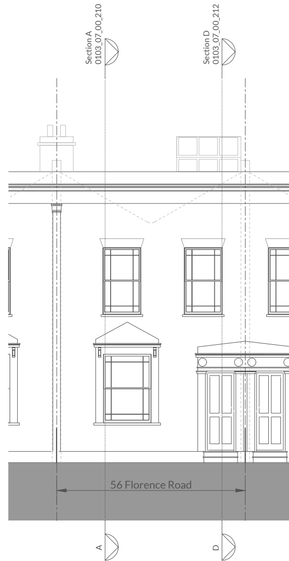
1) EXISTING - ELEVATION - SOUTH / FRONT