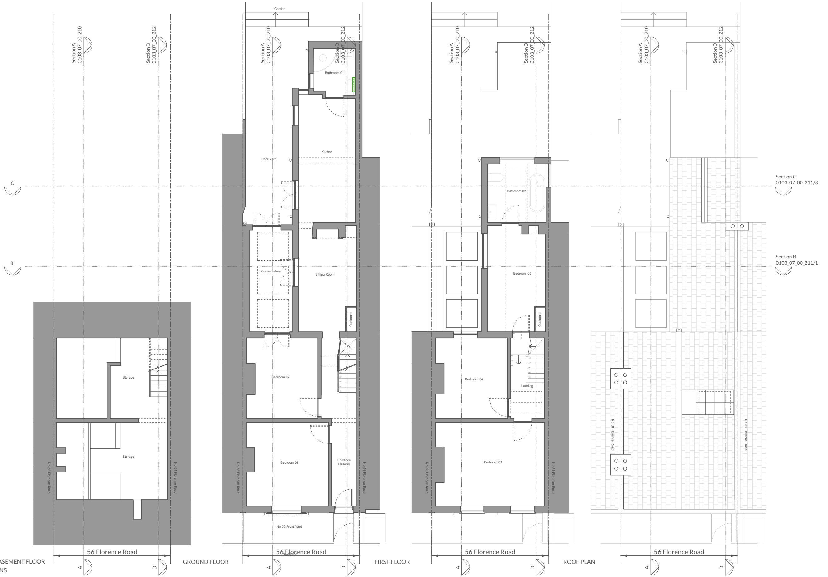
1) EXISTING - FLOOR PLANS