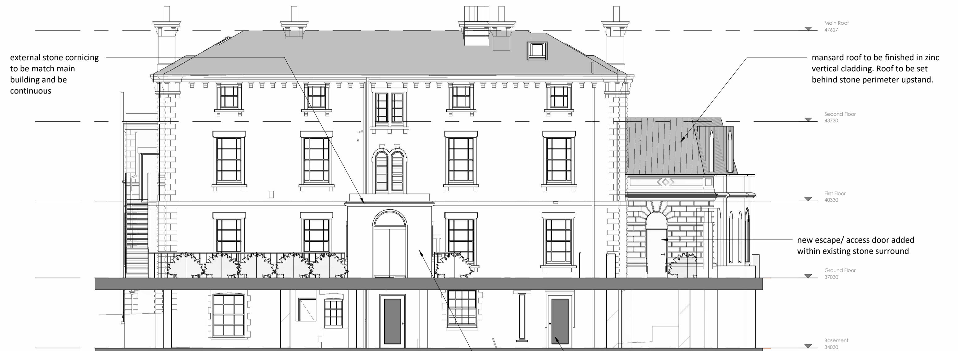
Proposed - East Elevation 1:100

existing window removed and replaced with a door to improve access/ escape - all profiles and stonework to match existing