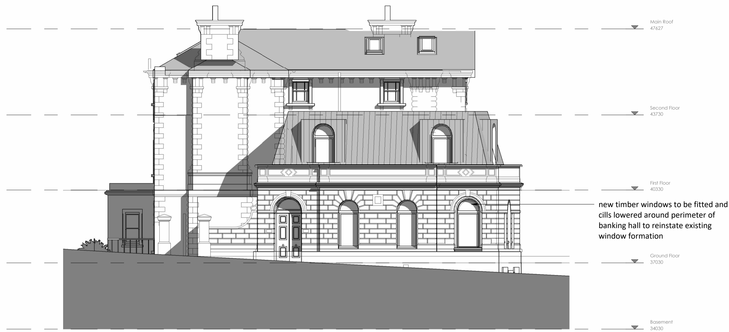
Proposed - North Elevation 1:100