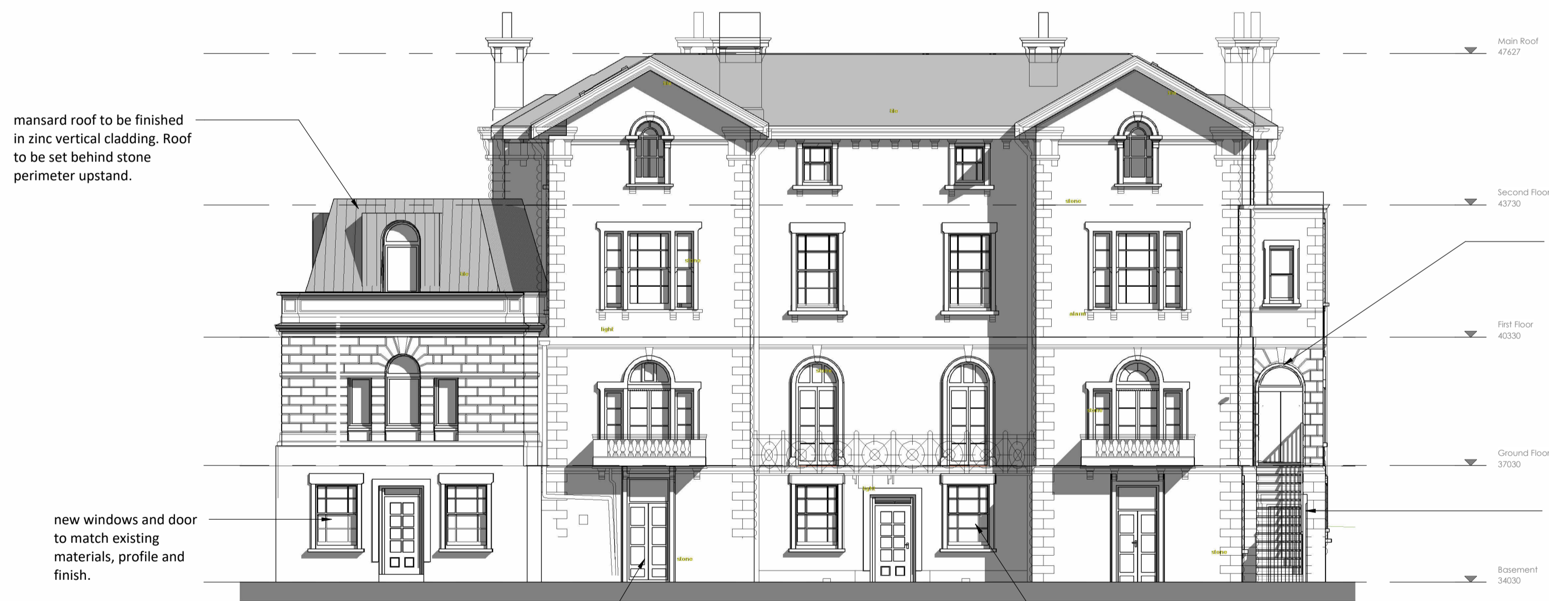
Proposed - West Elevation 1:100

new rear entrance to be finished in stone to form seamless connection with main building. All doors/ windows finished in timber to match existing.