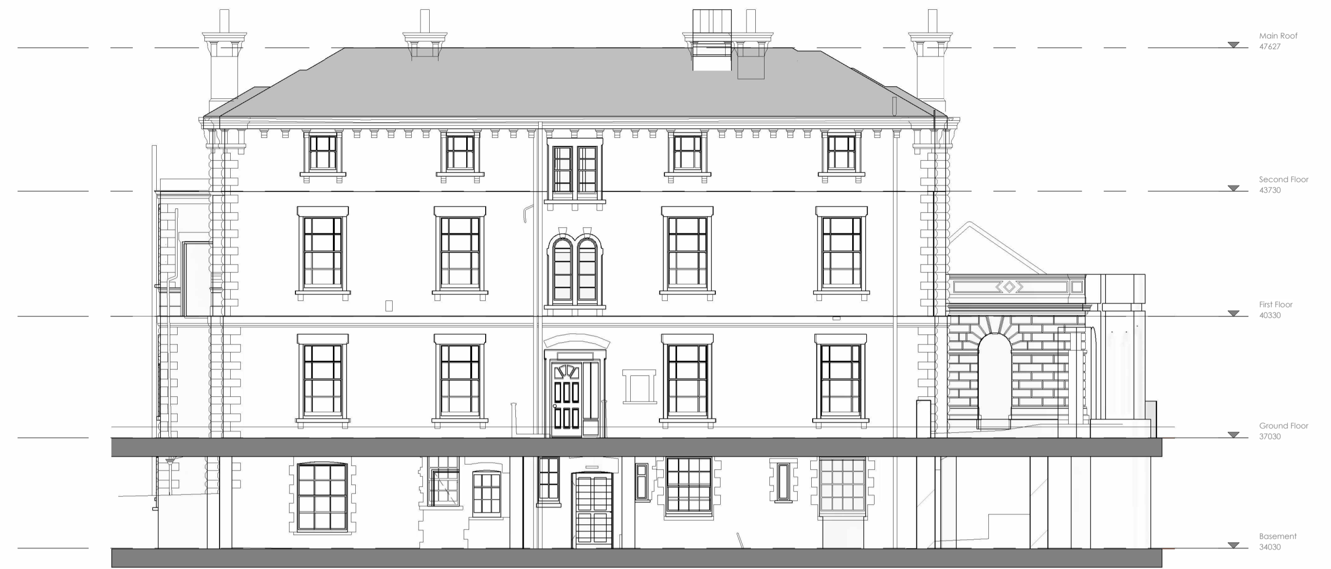
Existing - East Elevation 1 : 100