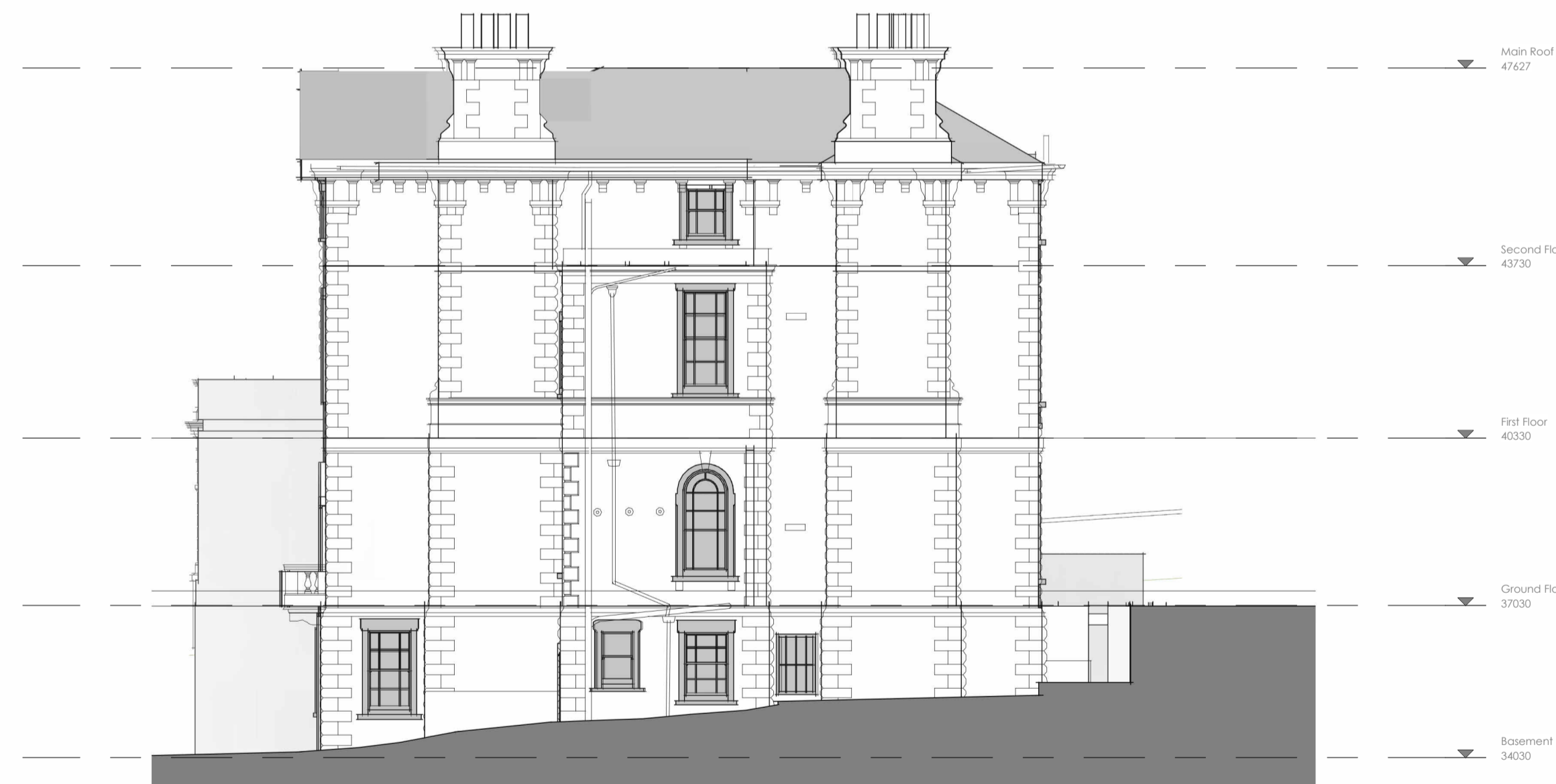
Existing - South Elevation 1 : 100