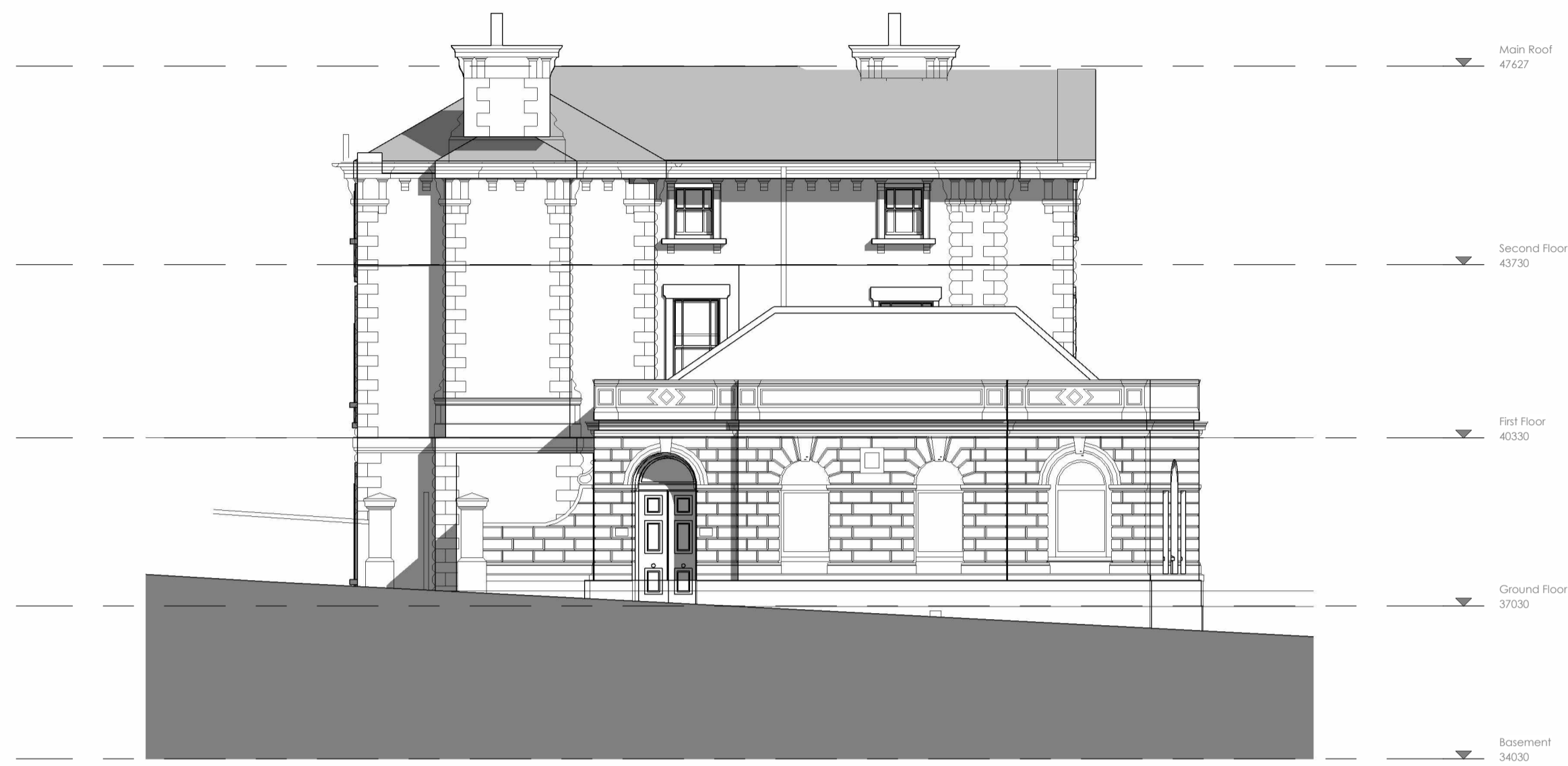
Existing - North Elevation 1 : 100