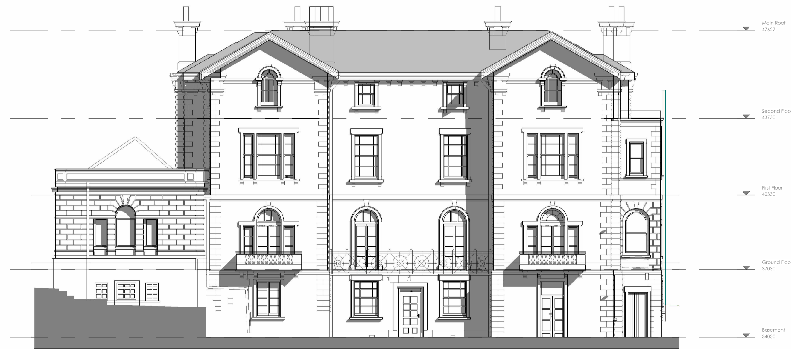
Existing - West Elevation 1 : 100