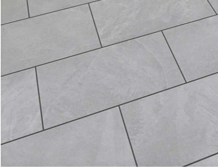
CONCRETE PAVING SLABS