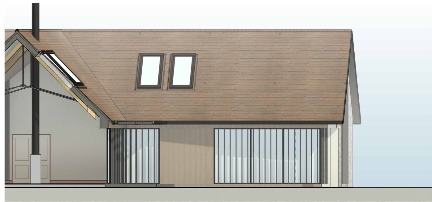
Internal West Elevation 1 : 100