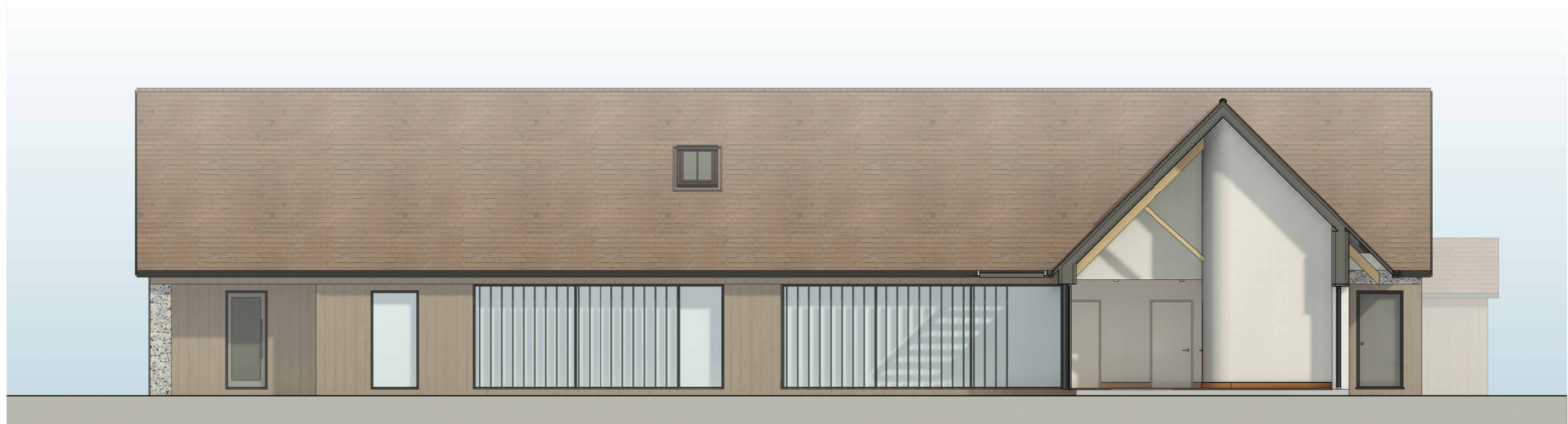
Internal East Elevation 1 : 100