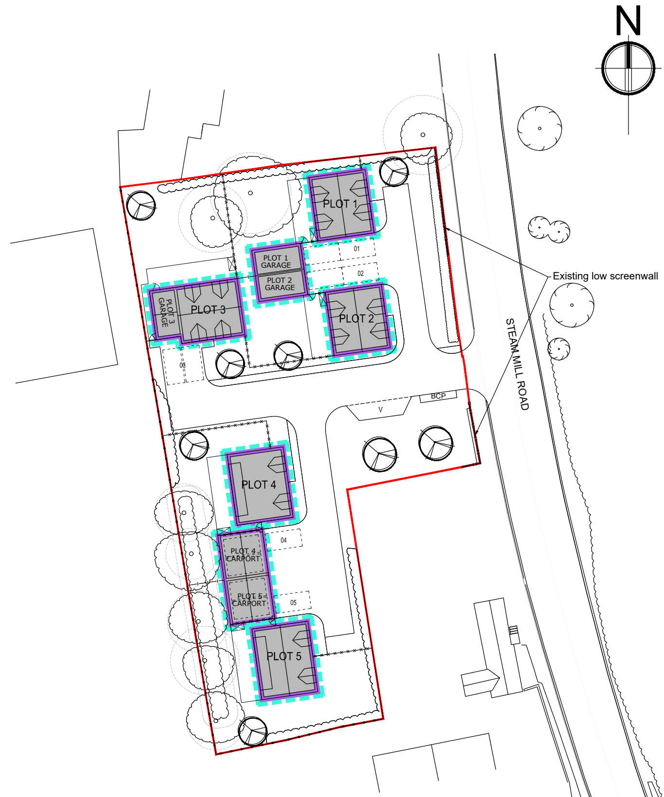
SITE LAYOUT 1:500