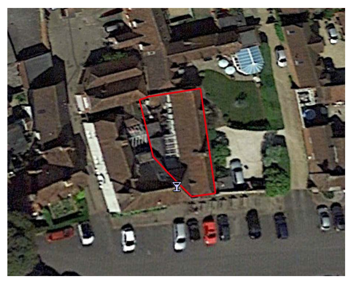
Figure 1: Approximate location of the site boundary (in red) from Google Earth Pro (Taken on: 7th June 2021)