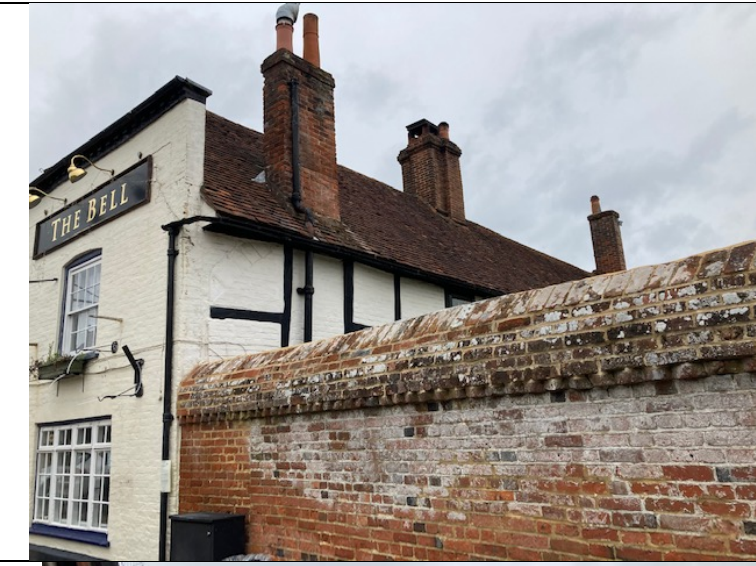
Photo 2: Overview of some of the outbuildings on site, looking south. The Bell lies on the left with lean to and slate covered

Photo 1: An overview of the southern and eastern elevation of The Bell.