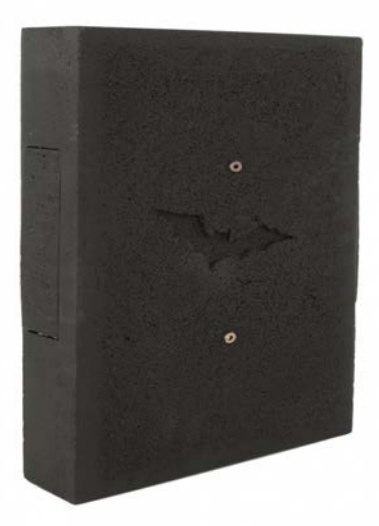
Figure 2: Vivara Pro Woodstone bat box

4.7 A total of two boxes, recommended Woodstone bat Box Vivara Pro (or similar) should be used, see figure 2. The internal compartment of these bat boxes are designed for crevice roosting bats such as the common pipistrelle, soprano pipistrelle, Nathusius' pipistrelle and myotis species which may be present in the local area. The box is made from WoodStone - a robust material composed of concrete and wood fibres, which has excellent insulating properties and provides protection from predators. This box should be installated directly under a roof edge or gutter at least 3m in height.