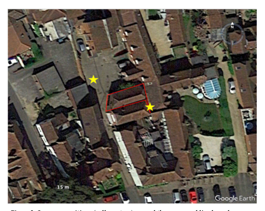
Figure 2: Surveyor positions (yellow stars) around the garage red line boundary