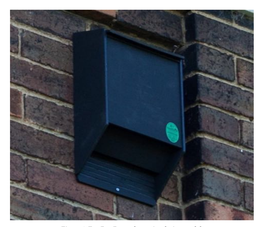
Figure 4: Eco Bat Box – the cavity design model.