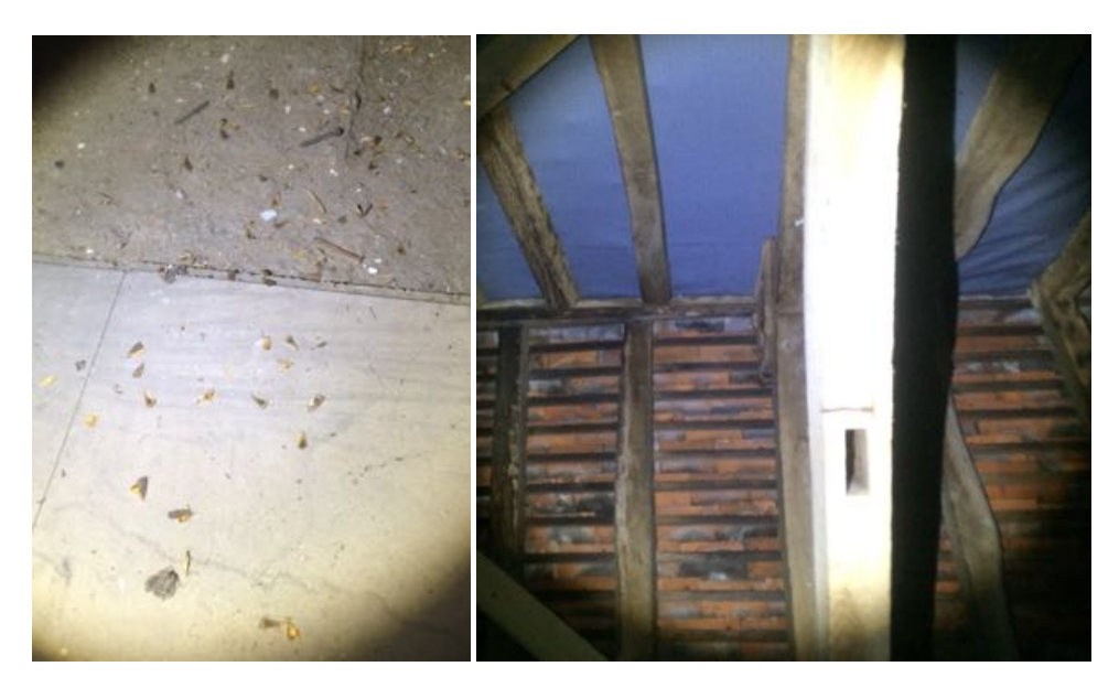
Figure 3- Feeding remains recorded underneath ridge and beam features towards the western elevation, prior to the survey conducted on 27th August 2021.