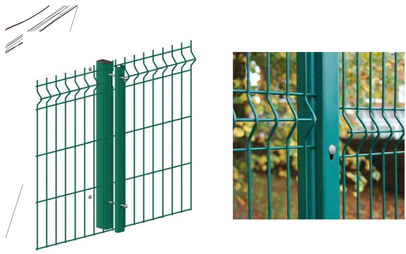
2.4m high Wire Mesh Fence (RAL 6005 - Green)

Drawing Reference: For 400KV Route Plan and Profile Permanent Diversion refer to Groundline drawings: 21762-GL-0608-ZZ-DR-Y-060250 21762-GL-0608-ZZ-DR-Y-060251 21762-GL-0608-ZZ-DR-Y-060252