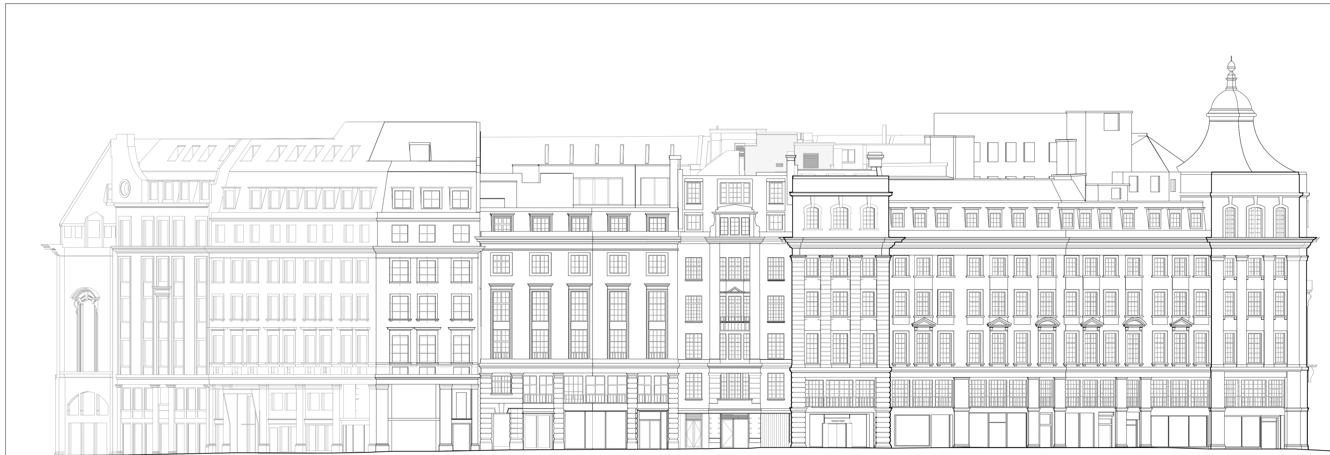
02 Existing Glasshouse Street Long Elevation

NOTES: Drawing based upon the formal survey information issued by CSL, dated March 2013. Information to read in conjunction with Structural Engineer and MEP Engineer package information All levels indicated as height above Ordnance Survey Datum All dimensions subject to a tolerance of +/-5mm. All details are indicative and should be reviewed against contractors selected supplier / manufacturer / system. Any variations are to be advised to and approved by the Contract Administrator prior to commencement on site.