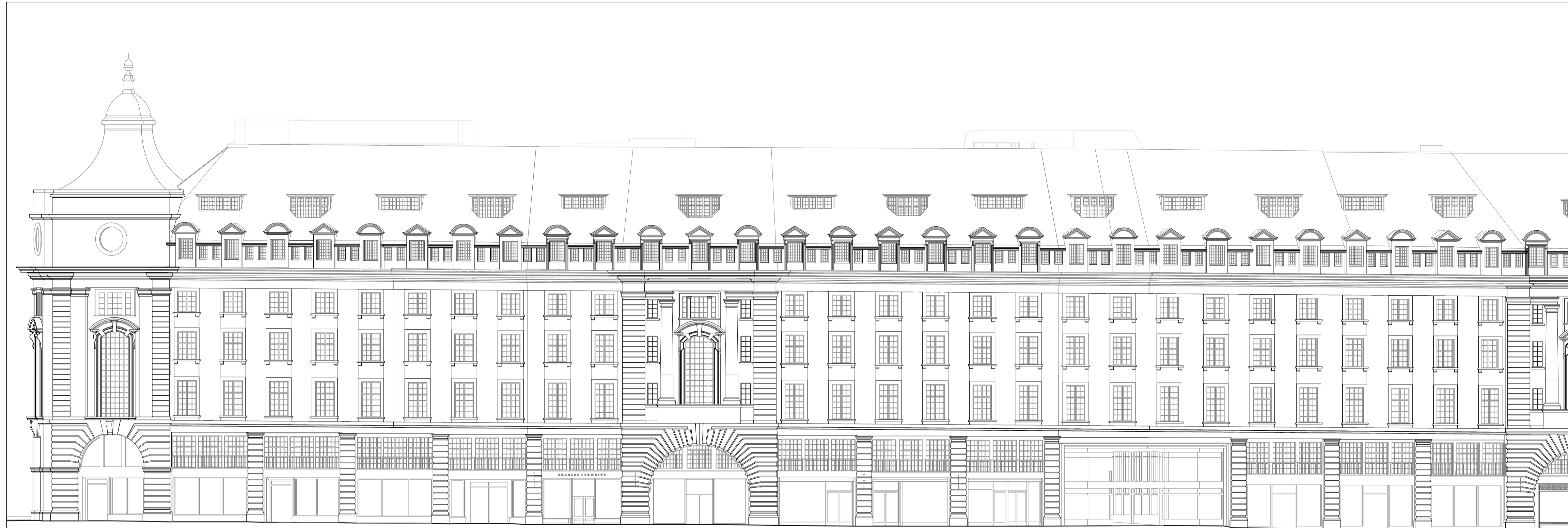
01 Existing Regent Street Long Elevation