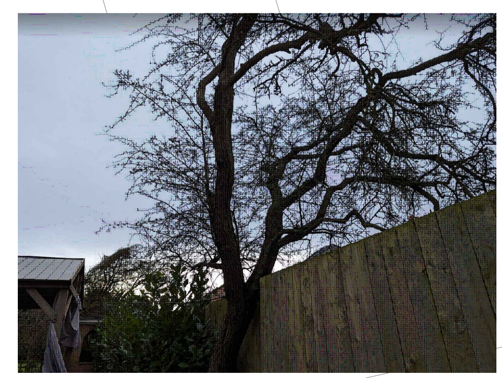
T1: 6m Ash Tree