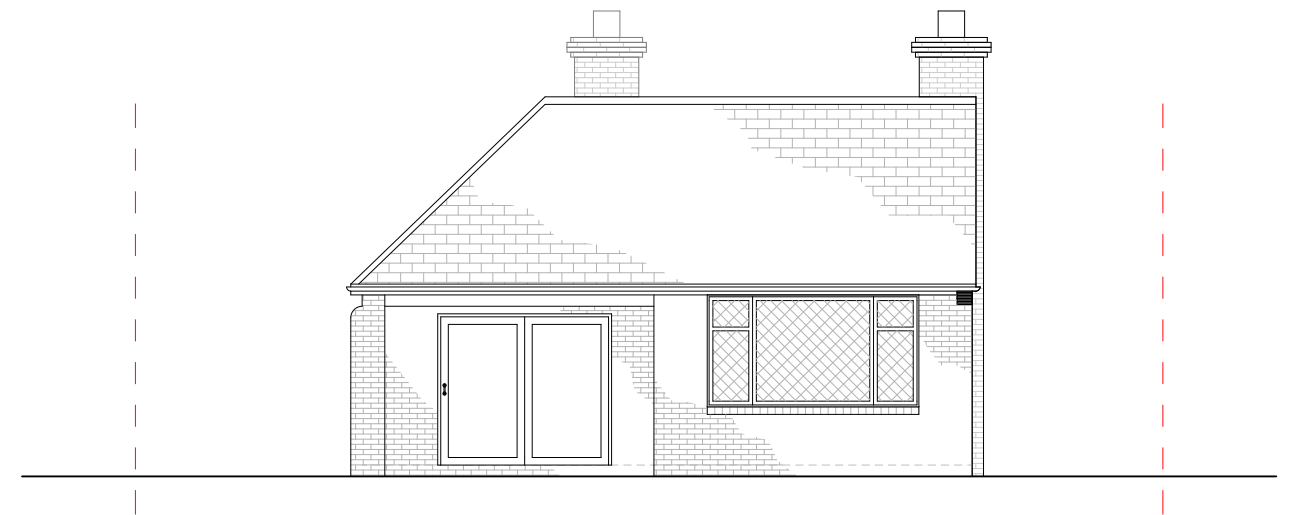
Existing Rear (North West) Elevation