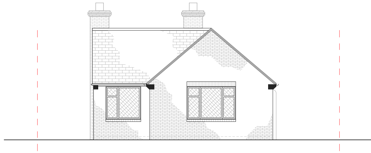
Existing Front (South East) Elevation