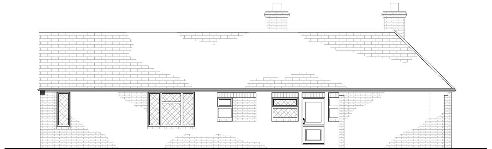
Existing Side (North East) Elevation