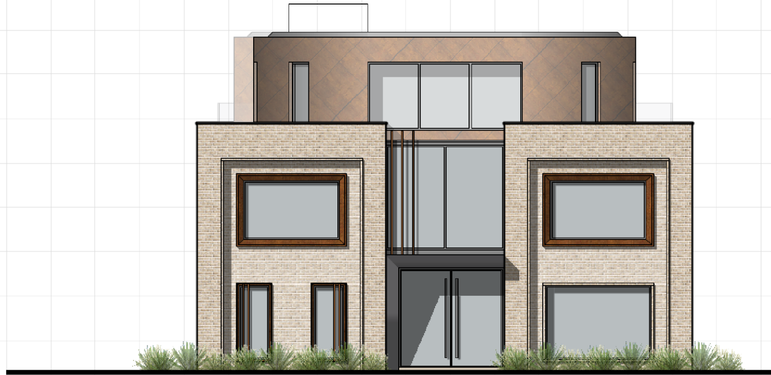
Front Elevation (North East) Scale 1:100 @ A3