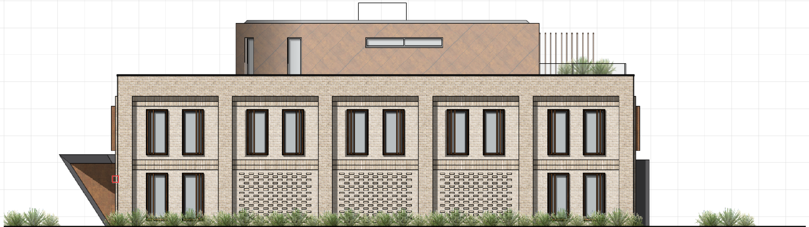
Side Elevation (North West) Scale 1:100 @ A3