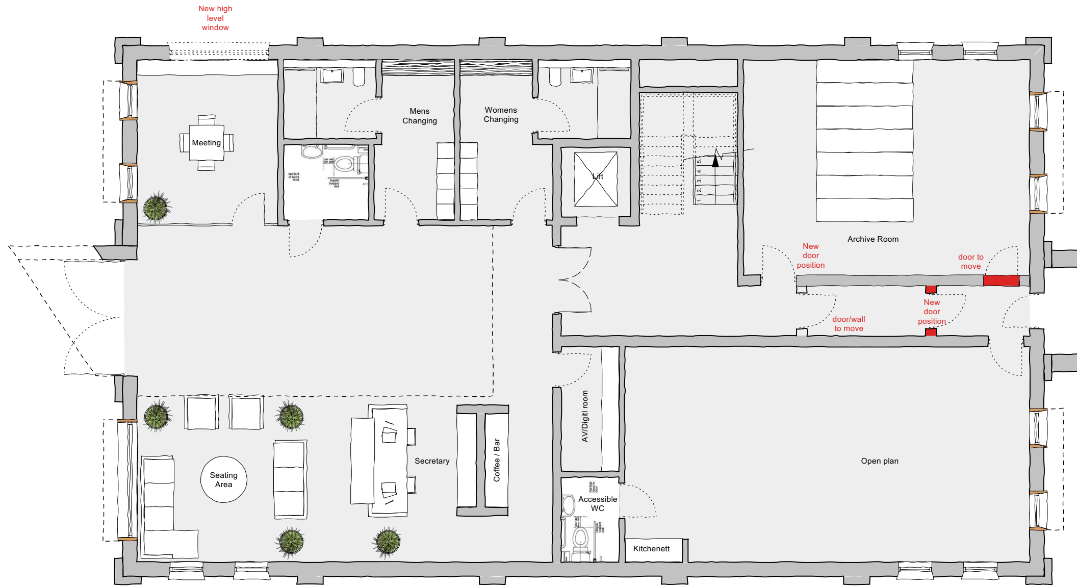
Ground Floor Plan Scale 1:100 @ A3