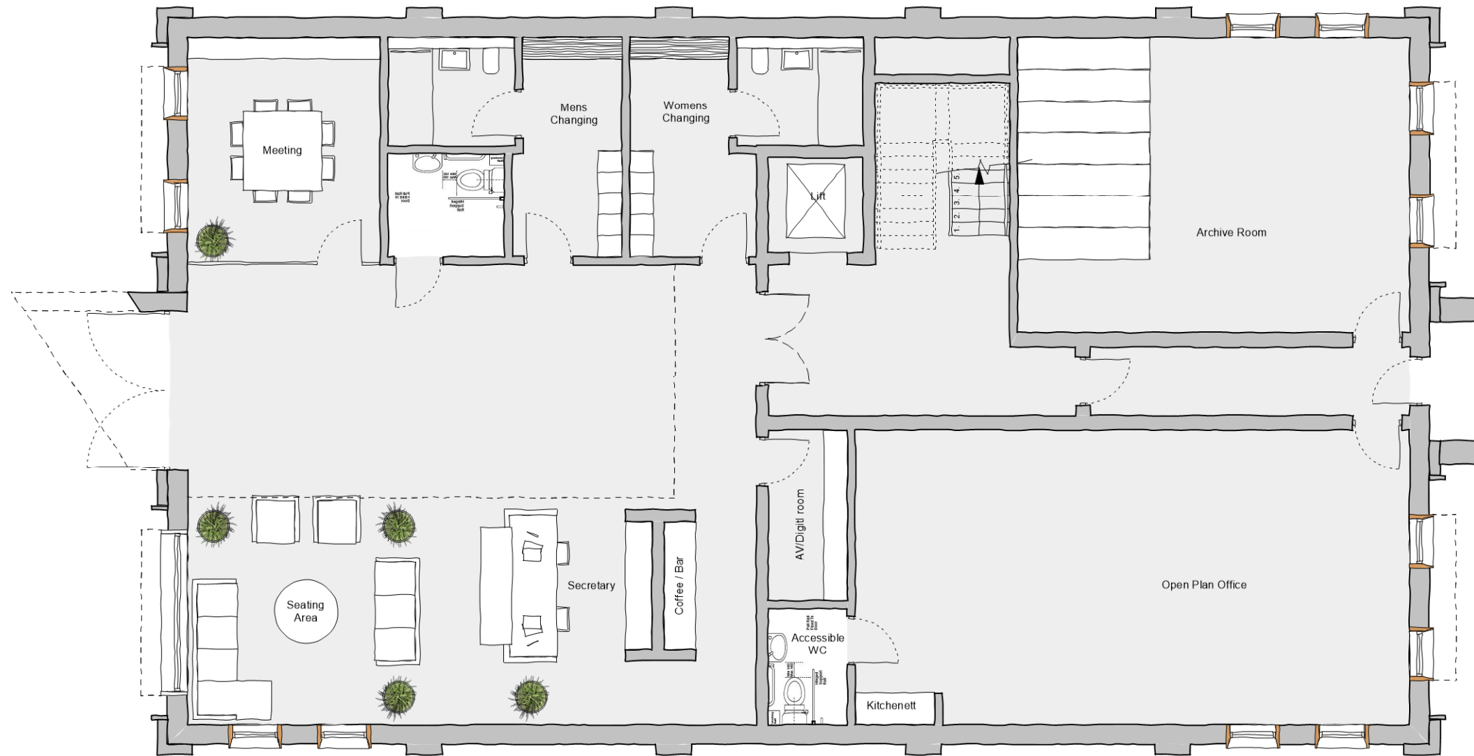
Ground Floor Plan Scale 1:100 @ A3