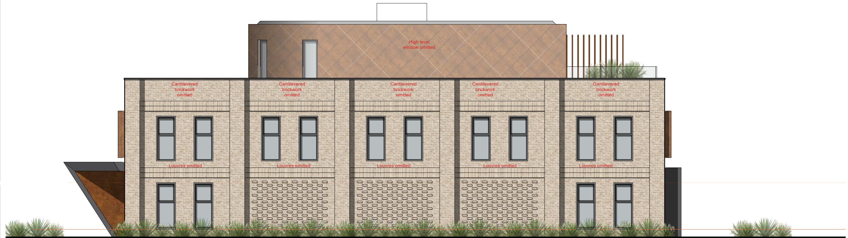
Side Elevation (North West) Scale 1:100 @ A3