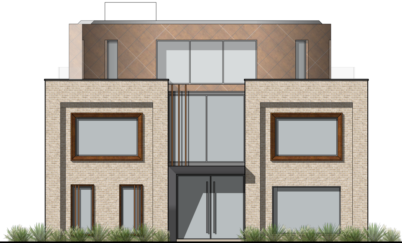
Front Elevation (North East) Scale 1:100 @ A3