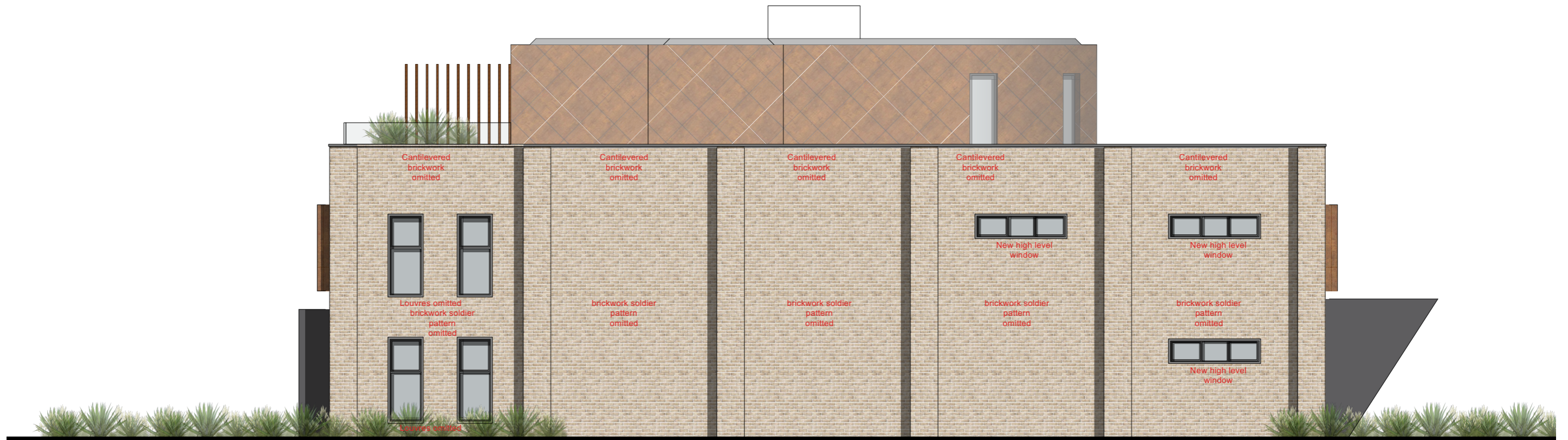
Side Elevation (South East) Scale 1:100 @ A3