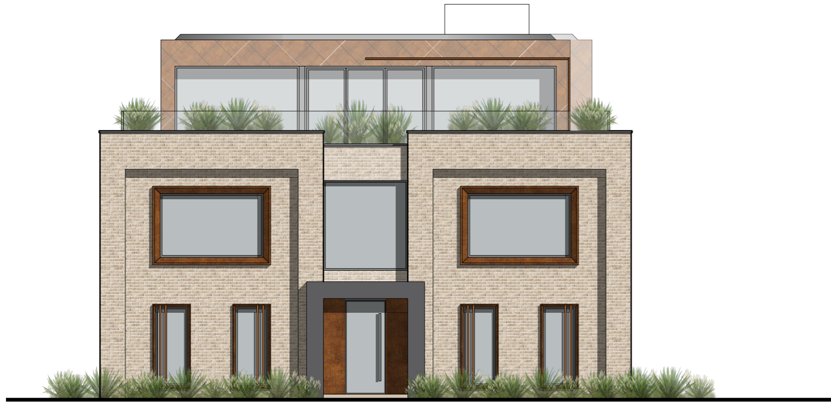
Front Elevation (South West) Scale 1:100 @ A3