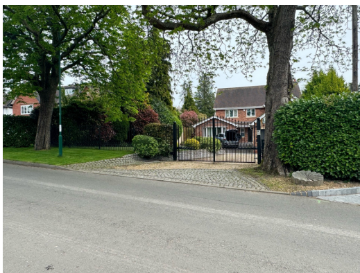
63A, Knowle Wood Road