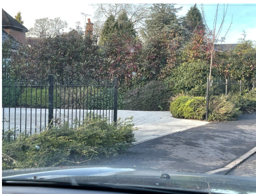
30B, Knowle Wood Road