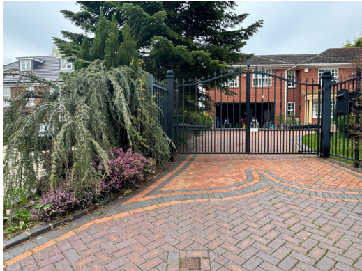
90, Knowle Wood Road (next door)