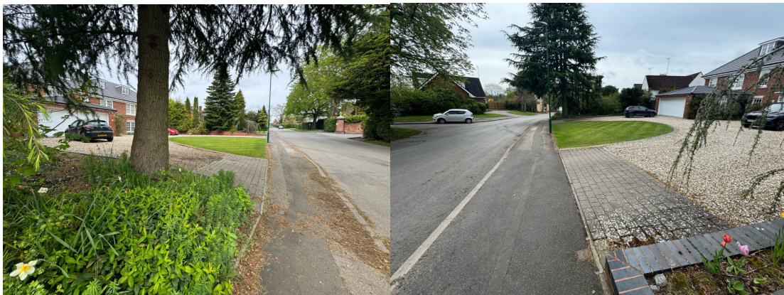
Images from either side of the drive.

As can be seen from the images below, our proposed design blends in well with the surrounding properties. In all the neighbouring examples, the railings have planting either inside or outside, to maintain the semi-rural feel of the road.