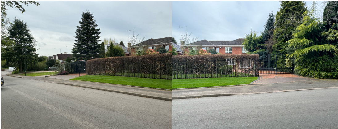
90, Knowle Wood Road (next door)