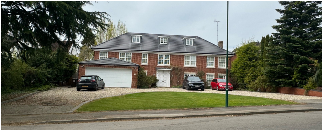
92, Knowle Wood Road, B93 8JP

Following a break in, the applicants wish to improve their security by adding railings and gates to the front of the property. This is in-keeping with the character of the street, which has a number of similar railings and gates.