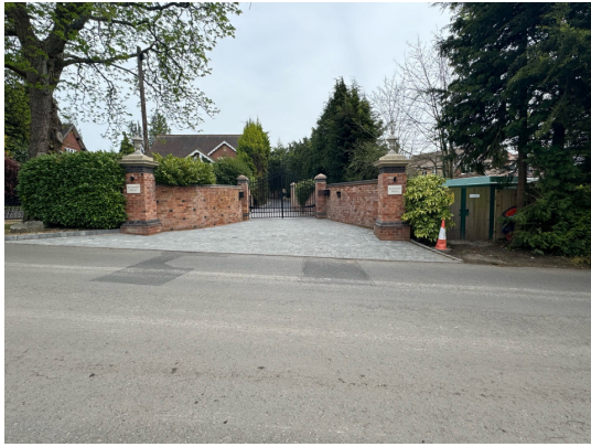
Richmond House, Knowle Wood Road