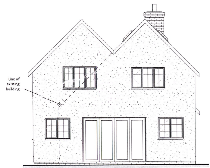
PROPOSED REAR ELEVATION 1 : 50