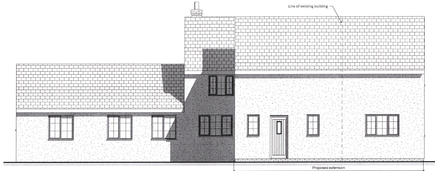
PROPOSED SIDE ELEVATION 1 1 : 50