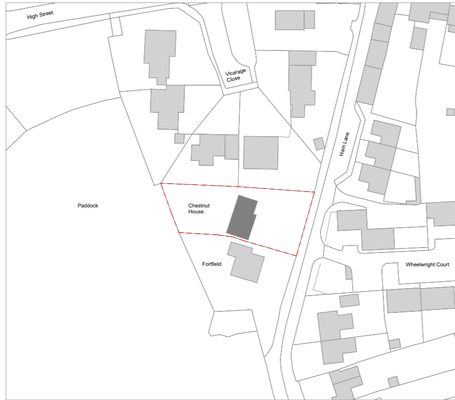
1 Location Plan_Existing 1 : 1250