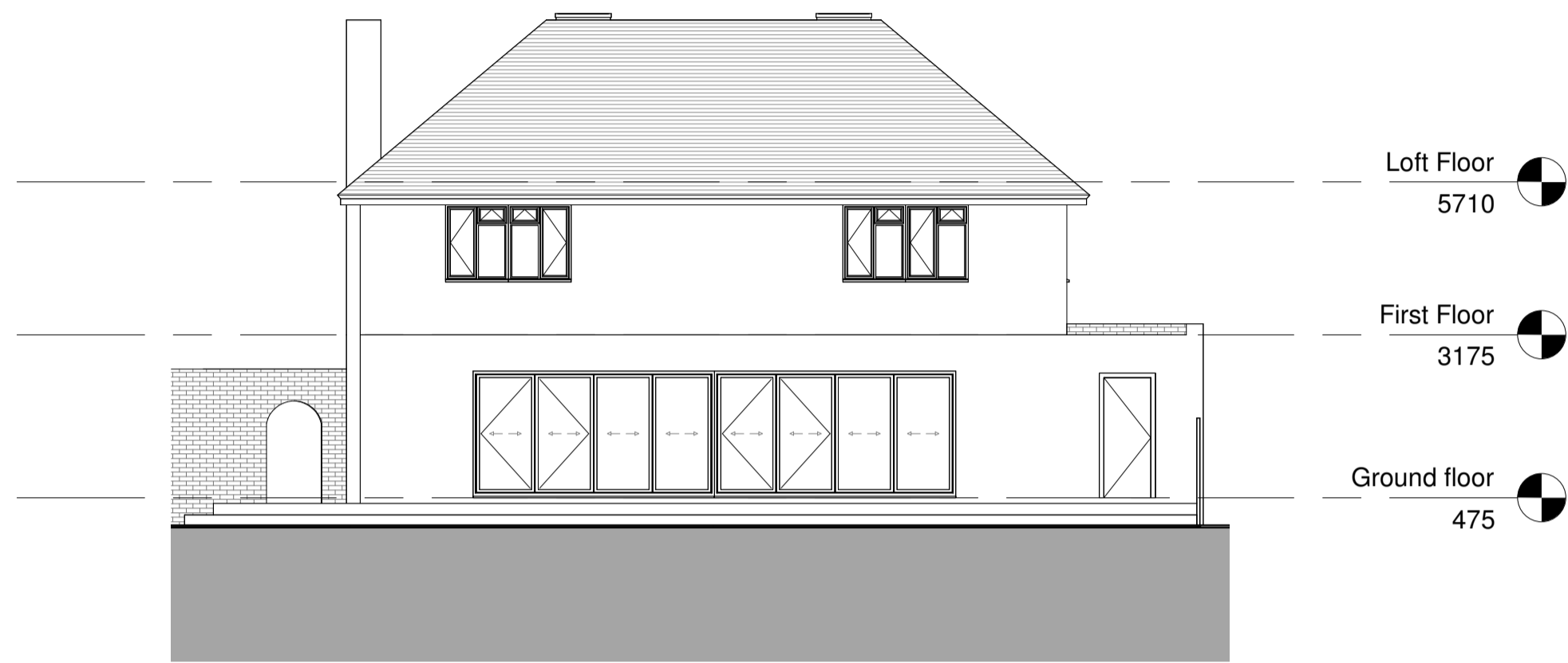
1 Proposed North 1 : 100