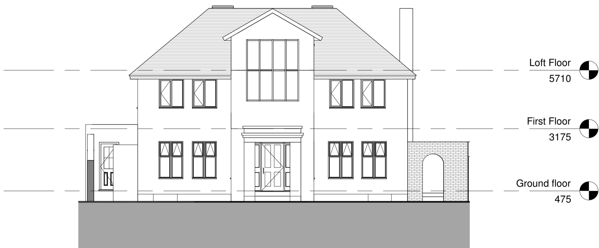
3 Proposed South 1 : 100