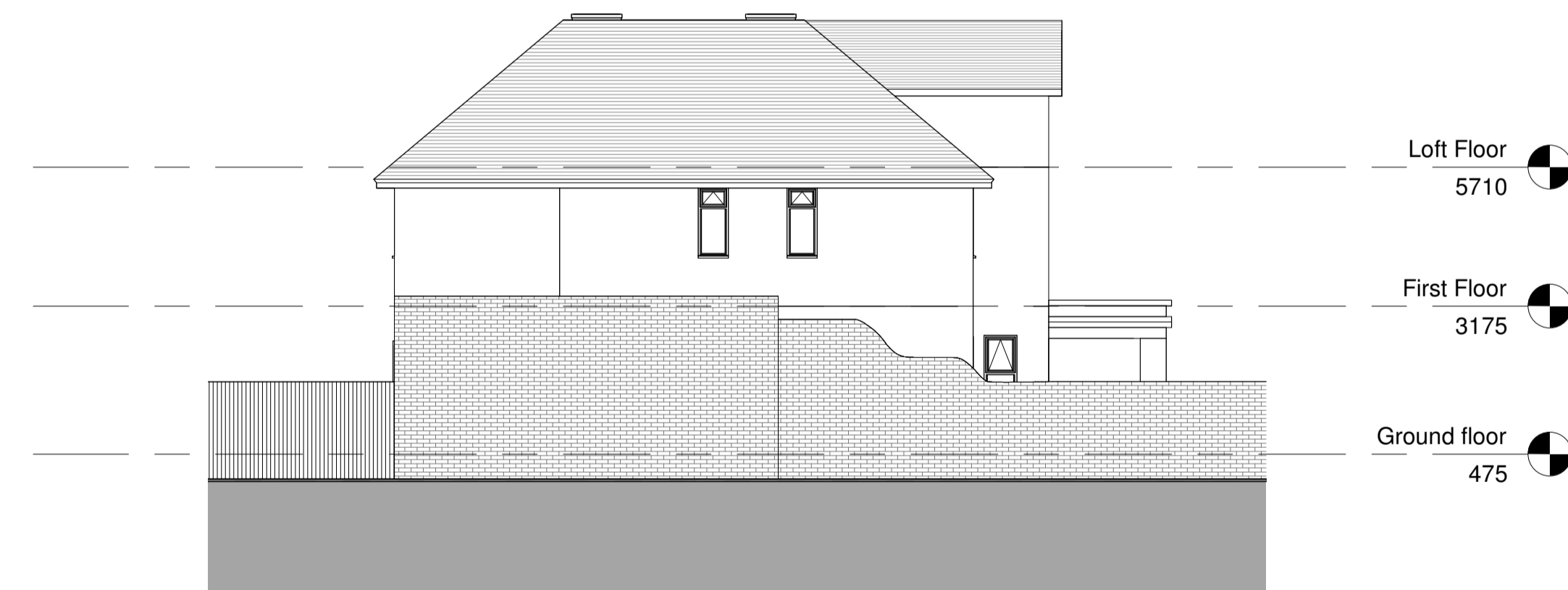
4 Proposed West 1 : 100