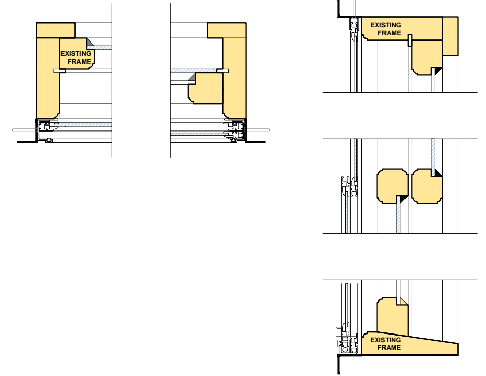
SECONDARY GLAZING DETAIL Sash cross section SCALE 1.5 A3

Secondary glazing to be fitted to all existing window openings.