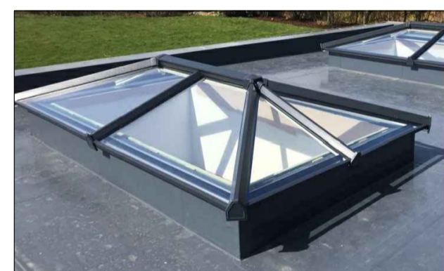
BLACK ALUMINIUM LANTERN STYLE ROOFLIGHT.