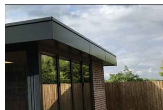
BLACK ALUMINIUM FASCIA TO CONCEAL HIDDEN GUTTER AND BLACK ALUMINIUM BIFOLD DOORS