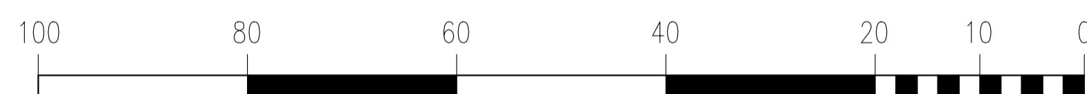
SCALE BAR - METRES (SCALE 1:500)