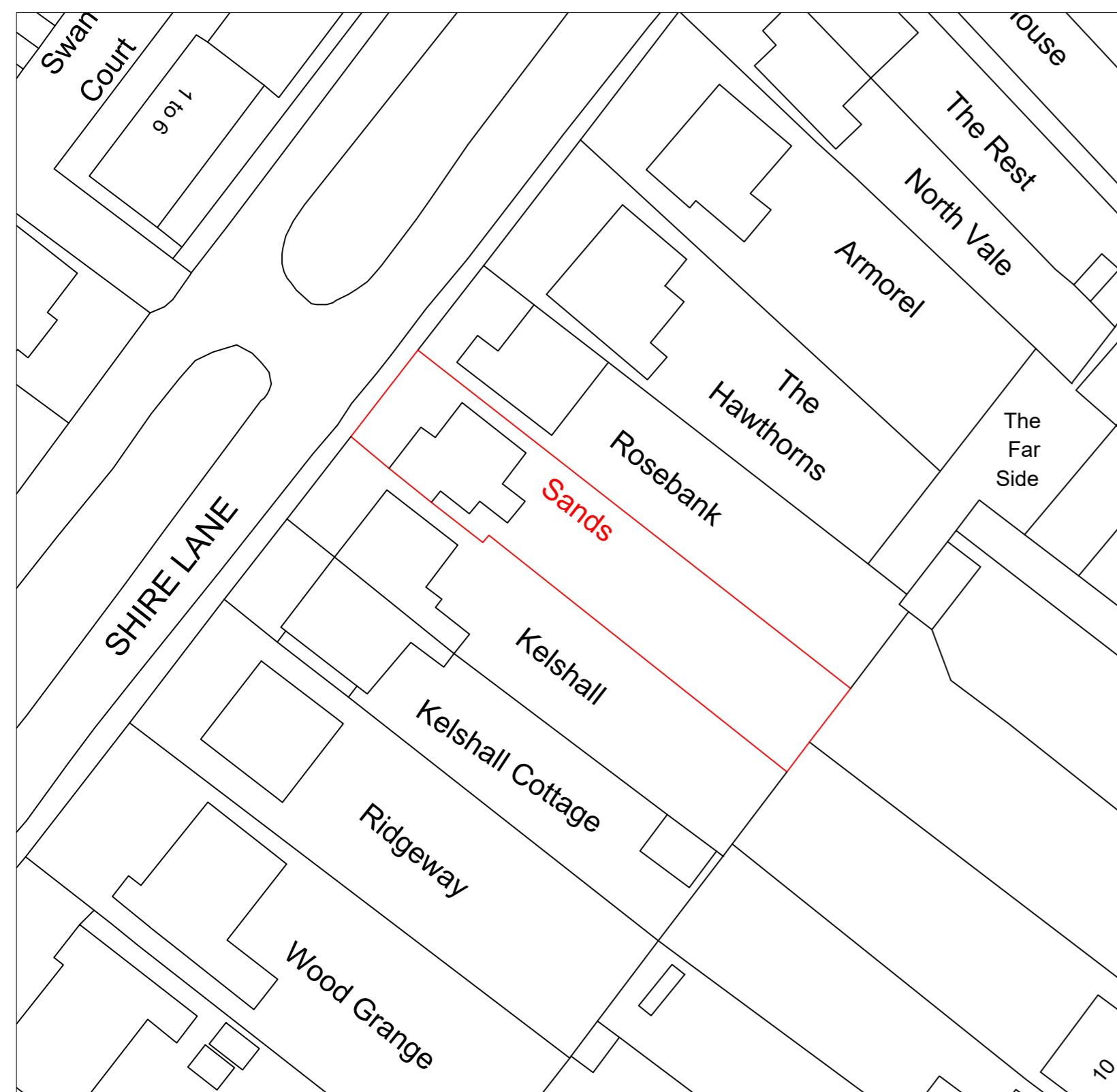
BLOCK PLAN Existing 1:500