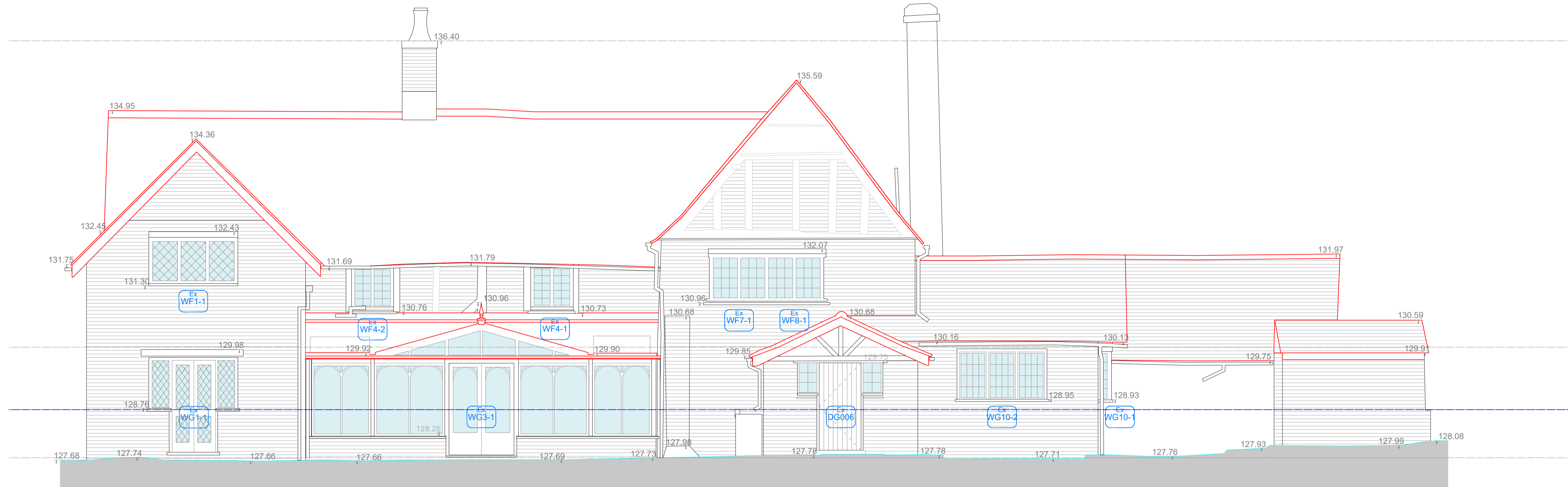
Rear (South) Elevation