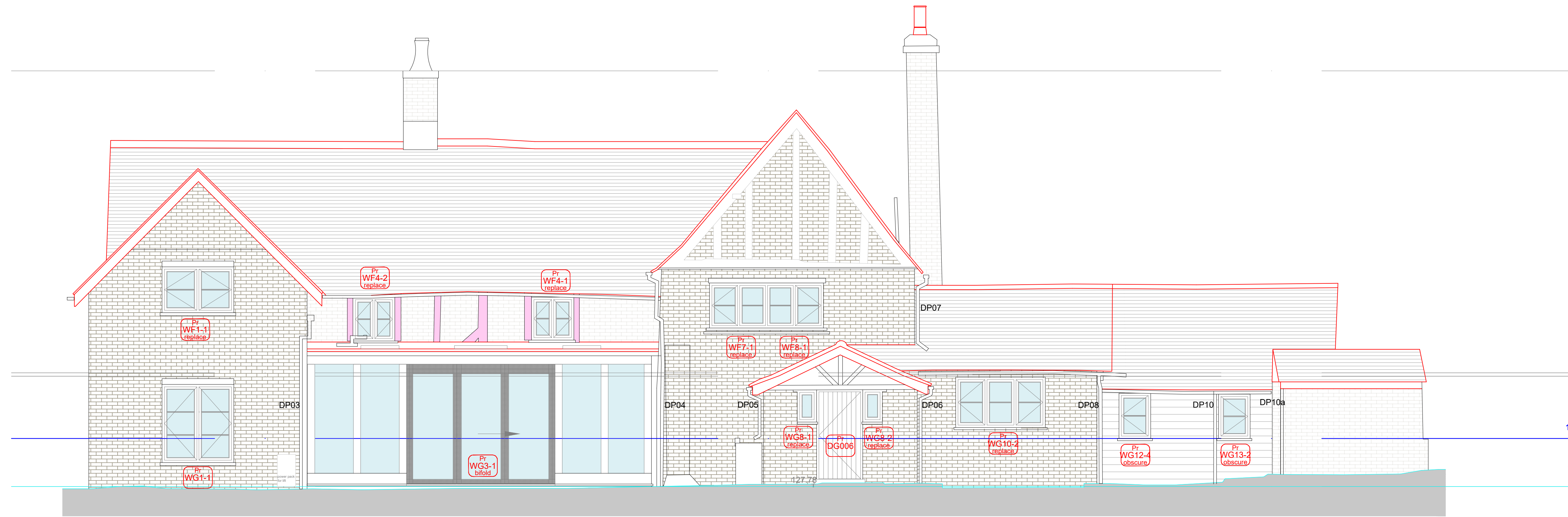
Rear (South) Elevation