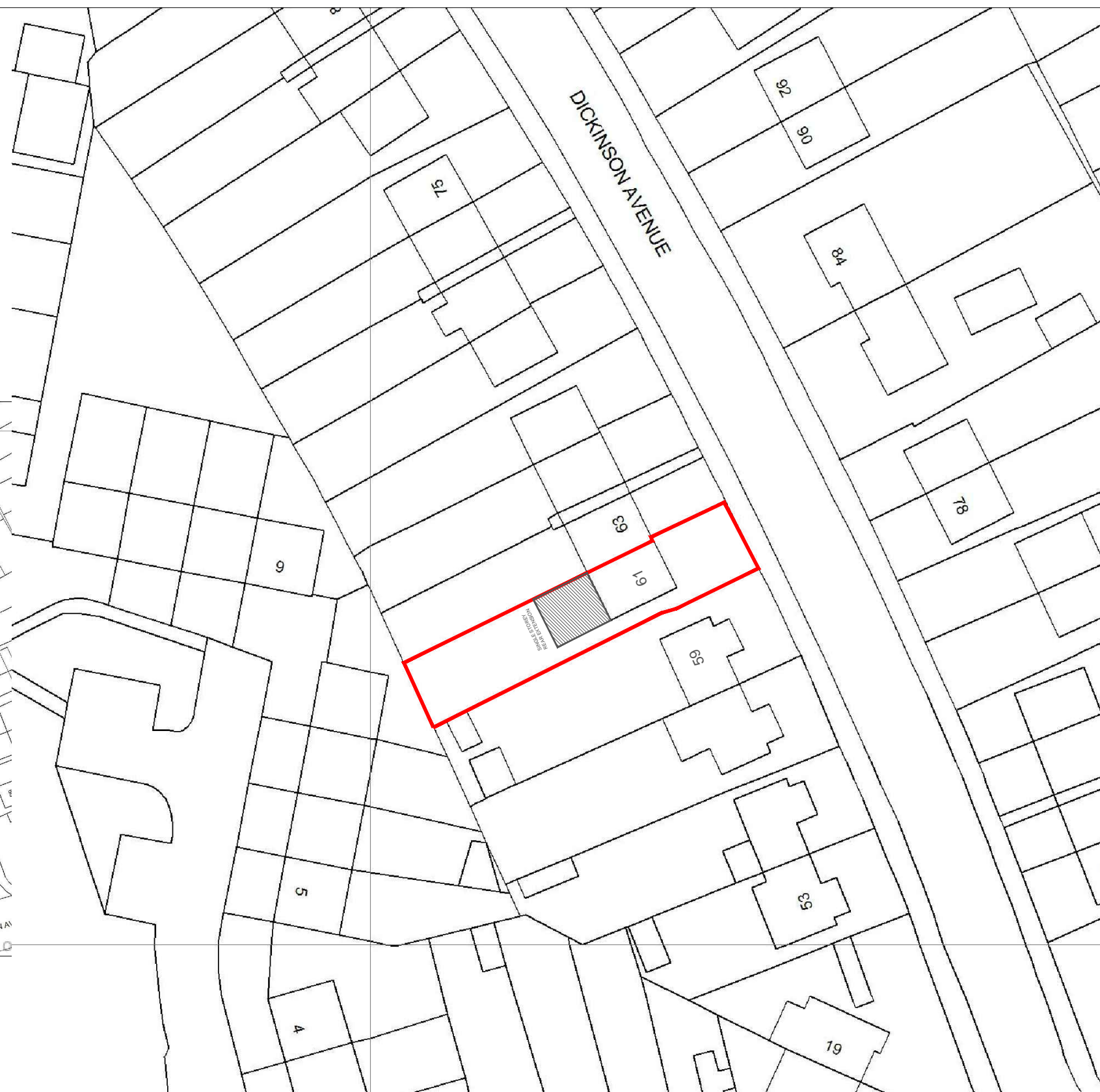
Site Plan 1:500