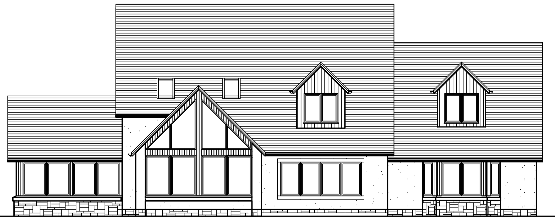
SOUTH ELEVATION... 1:100