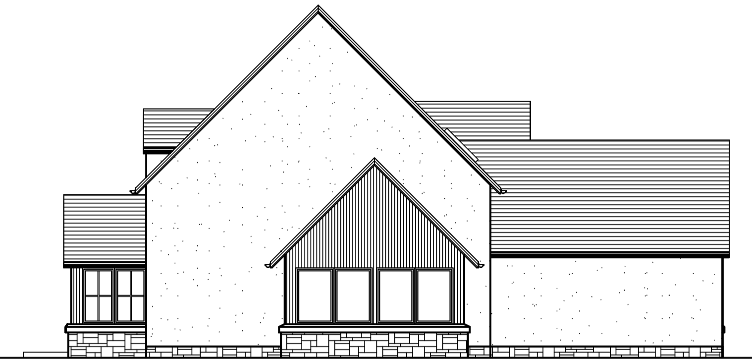
WEST ELEVATION... 1:100