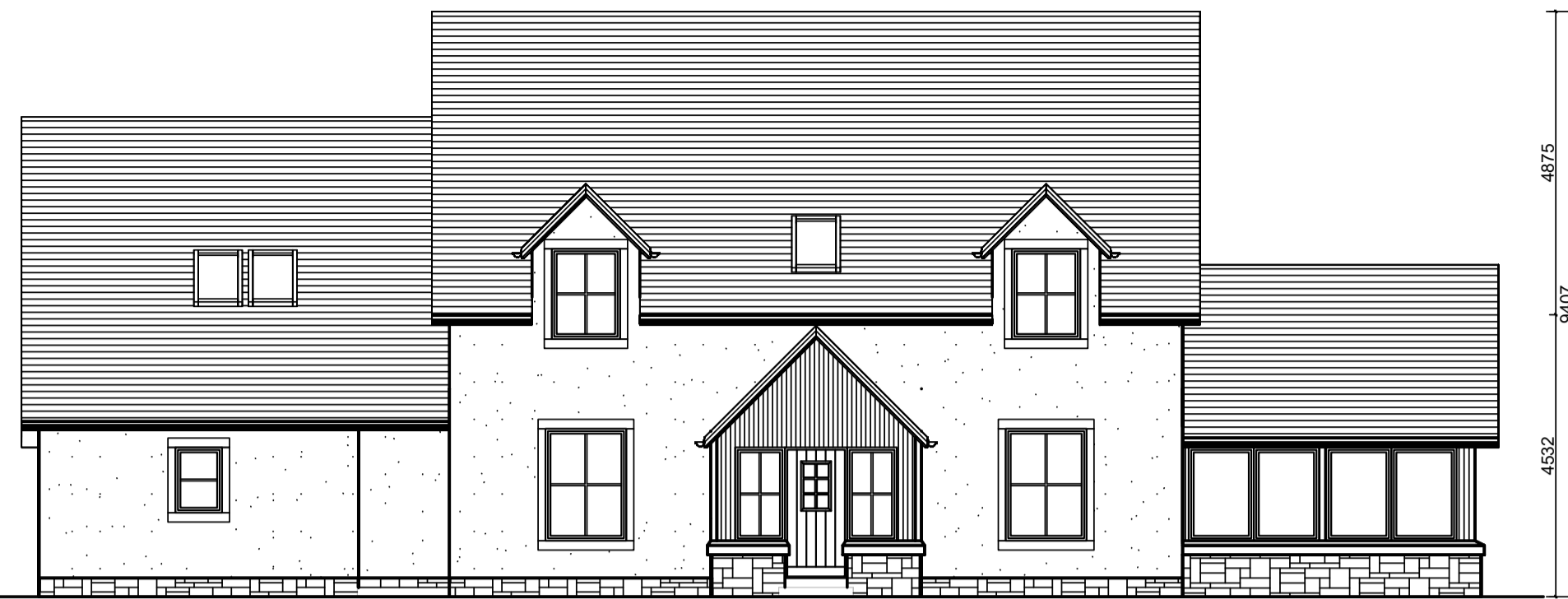
NORTH ELEVATION... 1:100