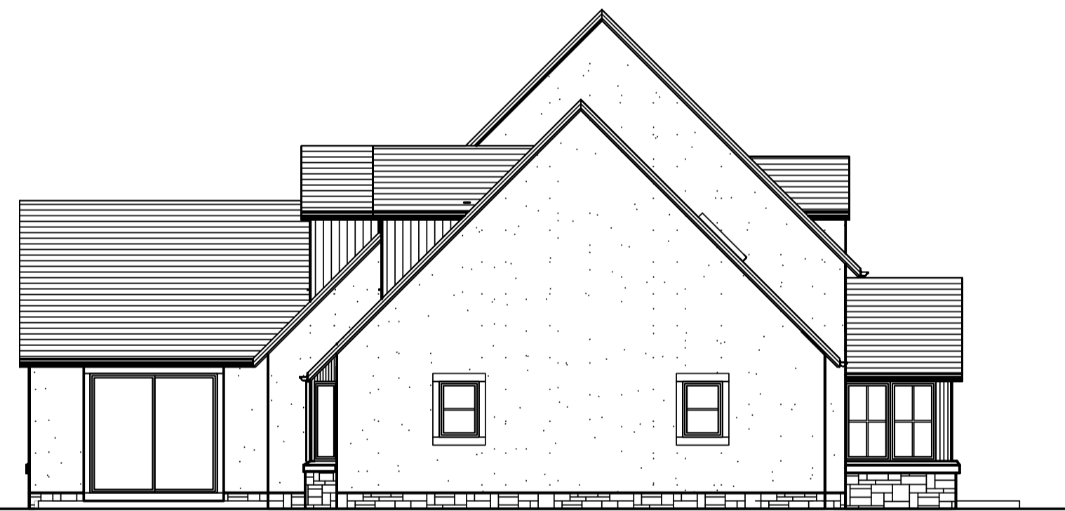
EAST ELEVATION... 1:100